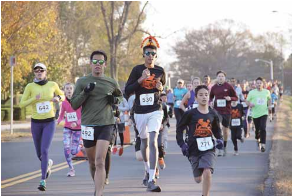
The Herndon Turkey Trot race will be held Saturday, Nov. 23 at the Herndon Community Center.

Art Show and Sale. 3-6 p.m. At Waltonwood at