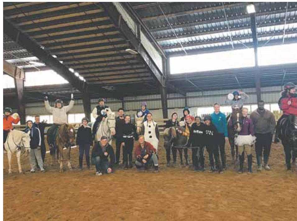
The blue ribbon awardees, volunteers and others at "Ride4SPIRIT" assemble in the champion line at Frying Pan Farm Park Equestrian Center in Herndon.