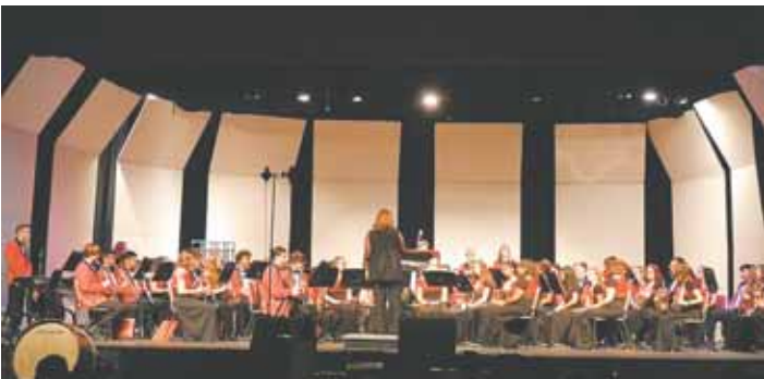
Wind Ensemble performing at the concert.

Dec. 7 — Herndon Tree Lighting Dec. 18 — Winter Concert