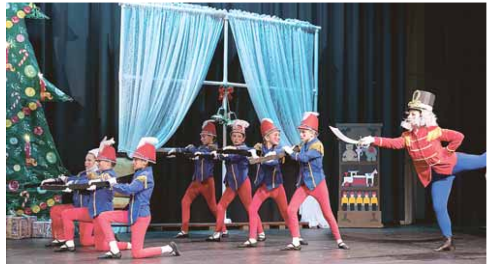
Students from the Mia Saunders School of Ballet perform the classic Battle Scene from "The Nutcracker."