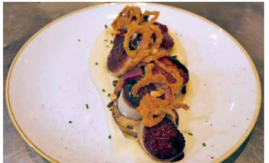
Customer favorite diver scallops with celery root puree, wild mushrooms, pine nuts, crispy shallots.