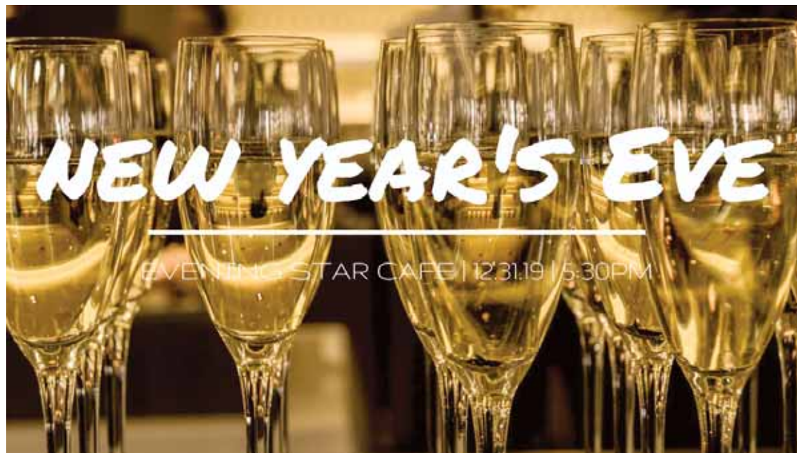
Evening Star Cafe is offering a four-course dinner for New Year's Eve.