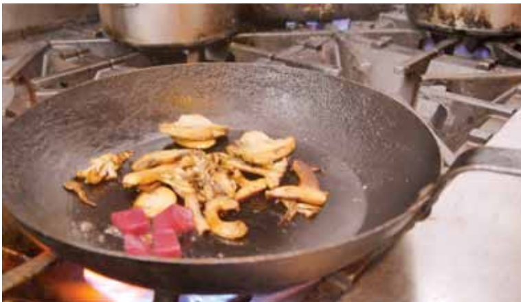
Cabernet poached Anjou pears added to skillet.