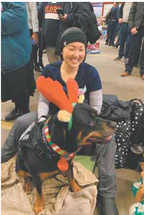
Caring Angels Therapy Dogs were on hand at the Firefighters and Friends toy distribution Dec. 12 at Fire Station 11.