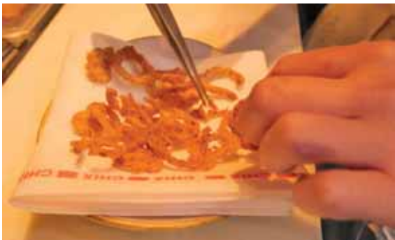
Shallots deep fried golden brown.