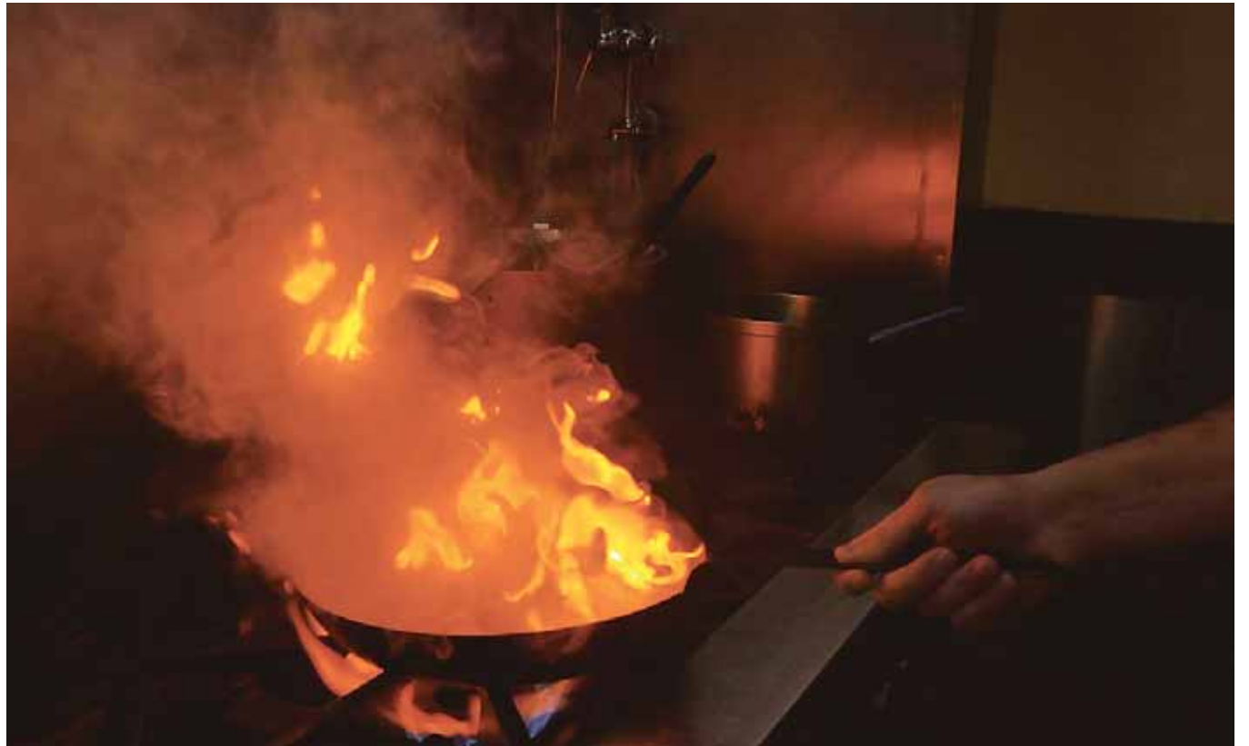
Mixed mushrooms deglazed with white Chablis.