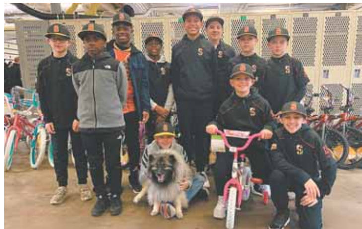
Volunteers from the Senators Little League 12 and Under Baseball Team from Charles County, Md., pose for a photo during the Firefighters and Friends annual toy distribution Dec. 12 at Fire Station 11.