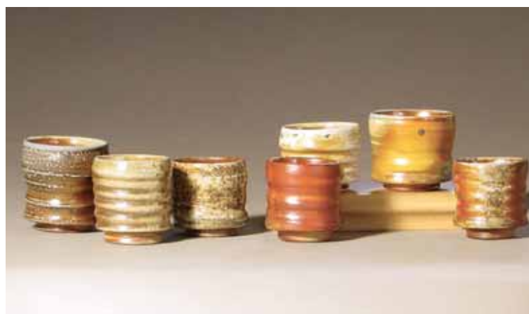
Hold On! Demitasse to Tumbler at Scope Gallery at the Torpedo Factory in Alexandria.

T.C. Williams Winter Concert. 7:30 p.m. At T.C. Williams High School auditorium, 3330 King Street, Alexandria. This is the 10-Year