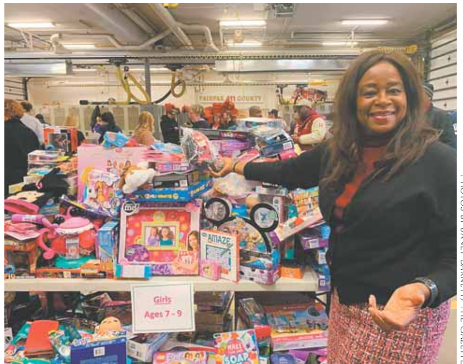
A World Bank employee prepares to hand out toys at the annual Fire and Rescue toy distribution Dec. 12 at Fire Station 11.