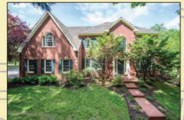
1506 Hardwood Lane McLean, 22101 $1,539,000

The Market is Moving! Call Me Today for a Free Analysis of Your Home's Value!