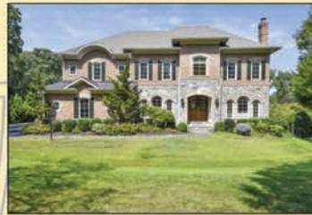
6456 Linway Terrace McLean, 22101 $2,295,000