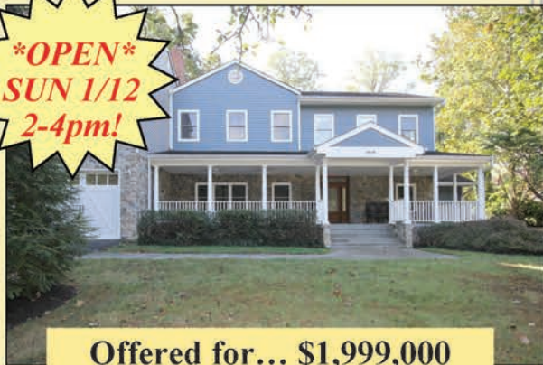
Offered for... $1,999,000