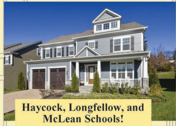
Haycock, Longfellow, and McLean Schools!

*FABULOUS* 4BR/3BA home in sought after Potomac Hills! This home features living room w/ picture window & wood burning fireplace; updated kitchen w/ granite counters & stainless steel appliances; gleaming hardwood floors on the main level; walk-out lower level featuring rec room w/ wood burning fireplace, bedroom, & full bath!