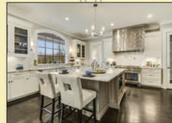
5906 Calla Drive McLean, 22101 $2,449,000