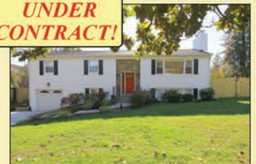
6635 Langdon Court McLean, 22101 $1,099,000