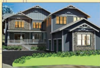
1911 Corliss Court McLean, 22101 $2,995,000