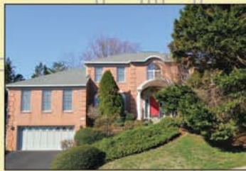
1612 Carlin Lane McLean, 22101 $1,250,000