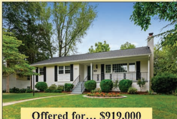
Offered for... $919,000

*WONDERFUL* 6BR/5BA home in convenient McLean location! This gorgeous home features sunny family room with fireplace and vaulted ceiling; gourmet eat-in kitchen; spacious master bedroom featuring en suite bathroom with double vanity and soaking bath; finished lower level rec room; beautifully landscaped backyard with patio!