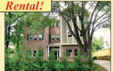
1870 Kirby Road McLean, 22101 $5,490/month