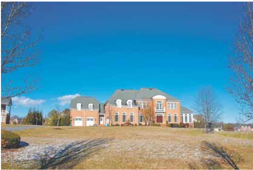
2 12515 Sycamore View Drive — $1,780,000

IN NOVEMBER 2019, 43 POTOMAC HOMES SOLD BETWEEN $2,000,000-$540,000.