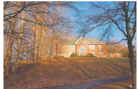
5 9476 Newbridge Drive — $1,400,000