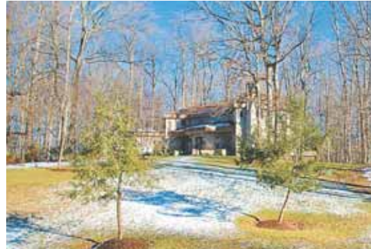
7 10705 Balantre Lane — $1,330,000