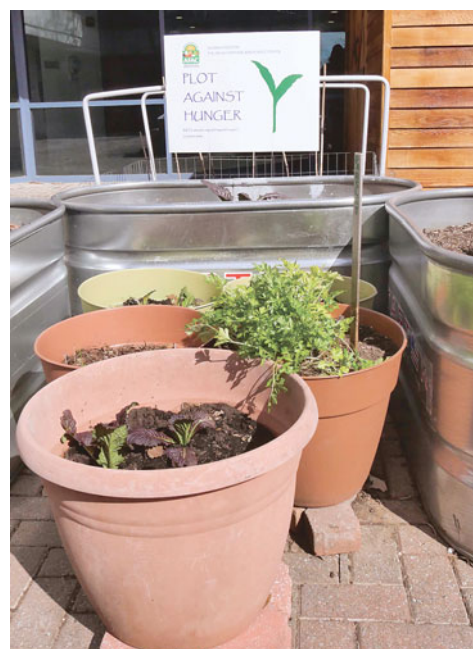
AFAC garden plot at the Central Library.

table offering free seeds for individuals, community groups and faith-based organizations to grow for contribution to AFAC during upcoming months.