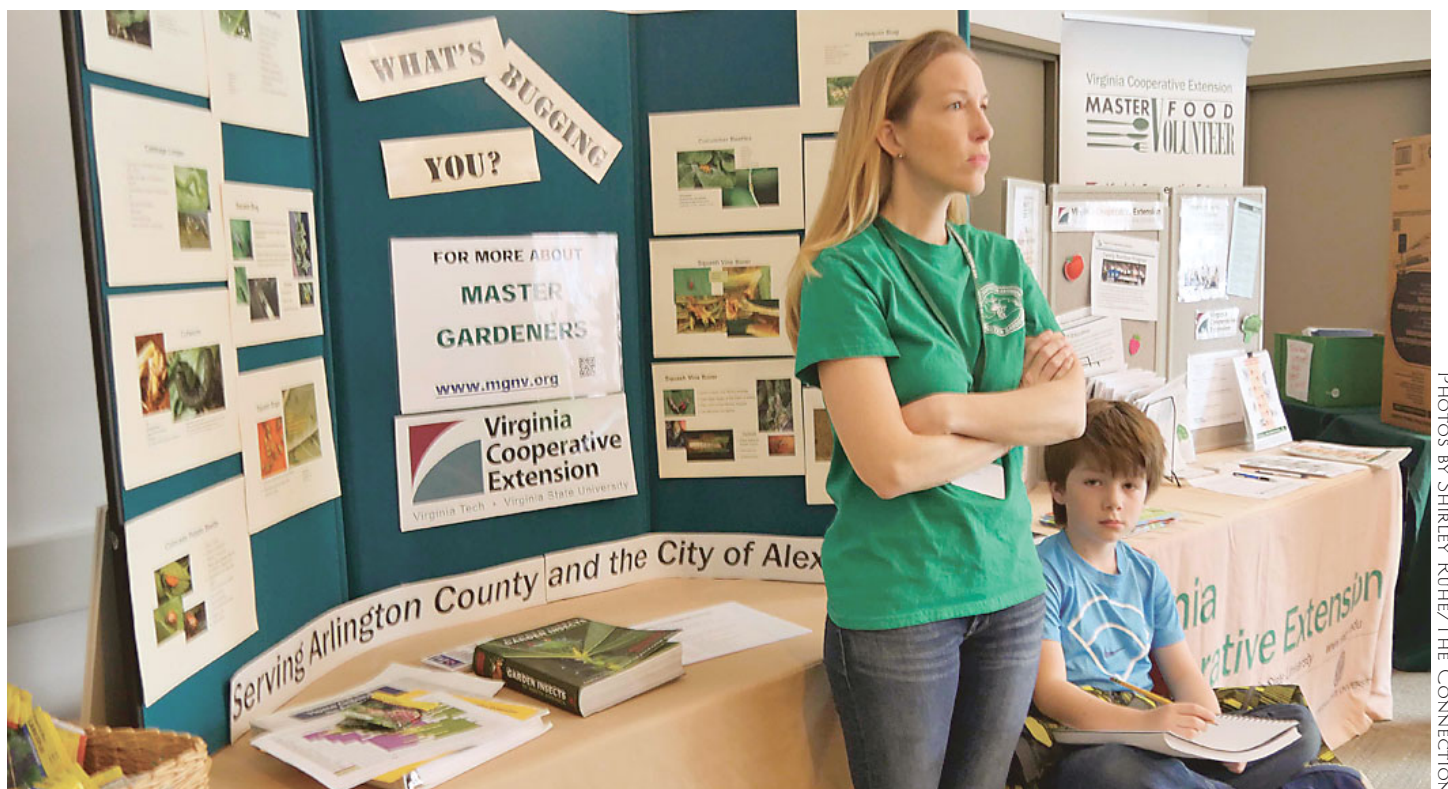
Garden Kick-Off event for all ages