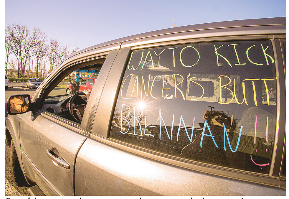
One of the encouraging messages written on a car in the procession.

He said prayer and reading his Bible have been key to keeping down his stress and anxiety. In addition, he's made two, separate, to-do lists nearly every day. One is for things he'd like to accomplish, such as work