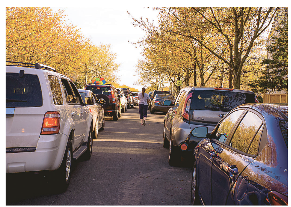
New Life Christian Church members drive by their pastor's home to show support.