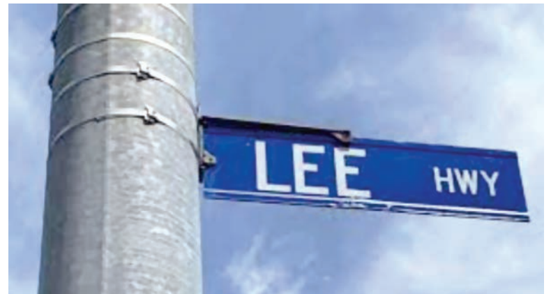
Lee Highway sign in Fairfax County.