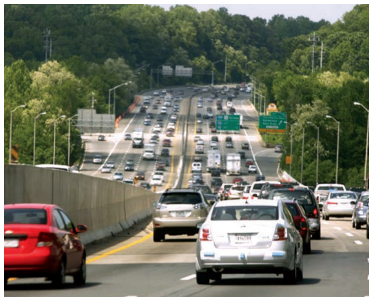
Traffic on the American Legion Bridge over the Potomac River—Source I-495 Express Lanes Northern Extension, Public Information Meeting, June 11, 2018.

meetings on the matter and some of the preliminary project concepts proposed.