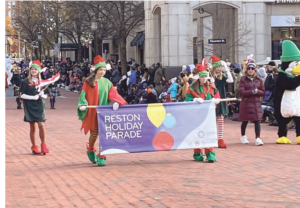
The Reston Town Center elves carry the Reston Holiday Parade banner joined by Reston Town Center's mascot dog, Resty, and Peppermint the Penguin.