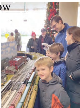
CONNECTION FILE PHOTO

Contact: herndonhistoricalsociety@gmail.com