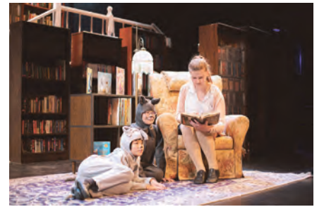
Encore Stage & Studio presents "Enchanted Bookshop Christmas" on Dec. 3-5 in Arlington.

Chanukah on Ice. 6-8 p.m. At Pentagon Row (Outdoor Rink), 1201 South Joyce Street, Arlington. Lighting of a Giant 6-foot Menorah. Eat Dinner: Hot Latkes, Kosher