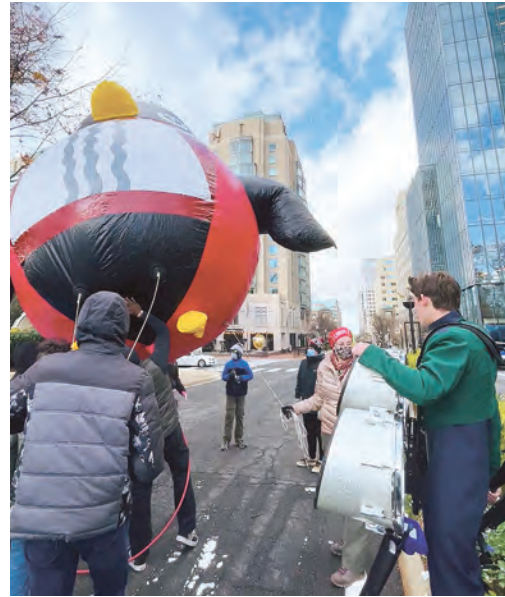
The cold, blustery winds are a challenge the morning of the Reston Holiday Parade 2021, leaving participants tight reigning the balloons and equipment as they gather at the top of Market Street, waiting to make the half-mile walk.