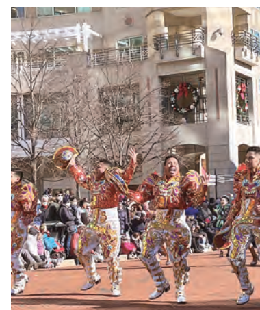
The performance group Caporales San Simon Sucre celebrates Bolivian culture.