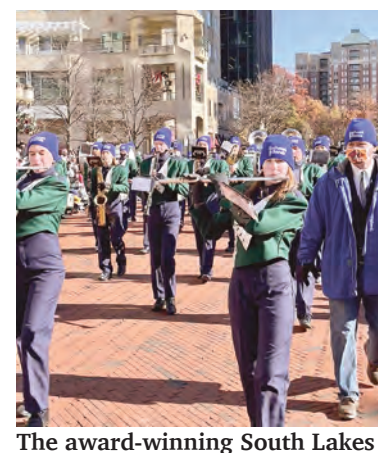
The award-winning South Lakes High School "Spirit of Reston" Marching Band plays their way down Market Street, announcing Santa and Mrs. Claus.