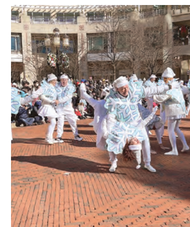
Gottaswing Dancers kick up their heels to a holiday tune.