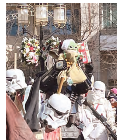
Members of the 501st Legion Inferno, an international STAR WARS costing organization.