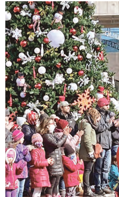
Standing under the Christmas tree is the perfect place to view the parade.