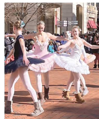
Conservatory Ballet of Reston