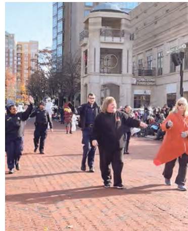
The 2021 Grand Marshals of the Reston Holiday Parade, First Responders and Frontline Workers, including representatives from the Fairfax County Health Department, Fairfax County Fire and Rescue, Fairfax County Police Department, and the Fairfax County Sheriff's Office.

"What are you thinking about this morning as the Reston Holiday Parade is about to start?"