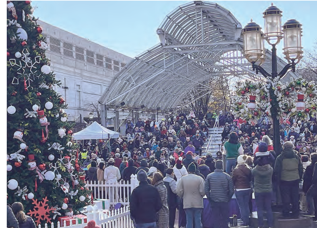
Parade goers find the perfect spots to view the Reston Holiday Parade 2021.