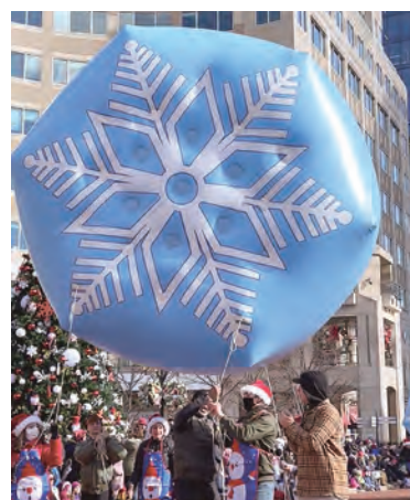
It's "Snow Much Fun" when the first of the trio of giant snowflake balloons make their way down the parade route.

"I'm looking forward to seeing the energy."