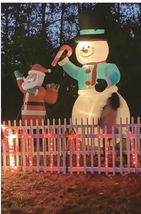
"Frosty the Snowman was a jolly happy soul...."