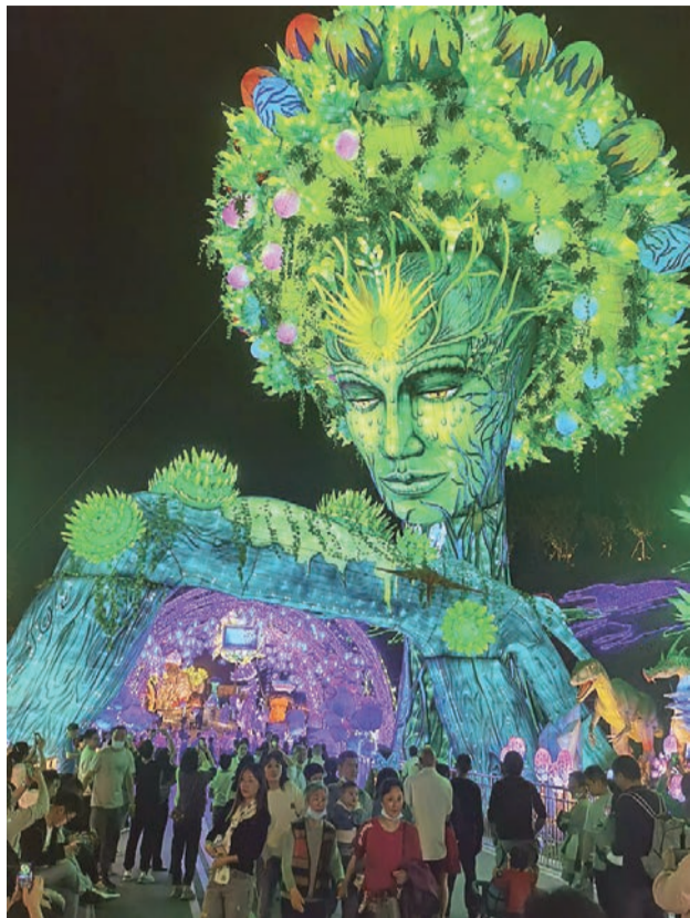
The Winter Lantern Festival will be held Dec. 16 Thru Feb. 12, 2023 in Tysons Corner.

Wednesday evenings from 4-6 p.m. Dec. 7 -- Holiday Shopping: Local Craft Market Dec. 21 -- Welcome Party (New residents) and Karaoke Dec. 28 -- Cooking Demo with Chef RSVP required. RSVP to HWTEMarketing@IntegraCare.com or call 703-429-1130.