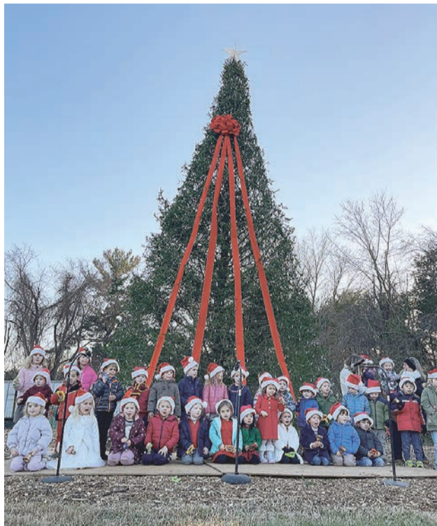
Children from Great Falls United Methodist Preschool wearing Santa hats sing in front of the Christmas tree on Sunday, Dec. 4, at the Celebration of Lights organized by Celebrate Great Falls Foundation.