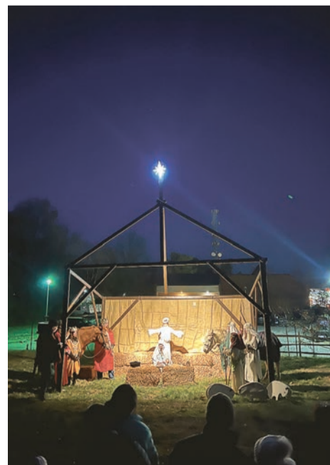
The Nativity scene brings to life the meaning of Christmas.