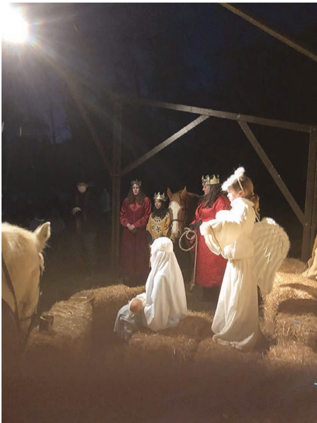
Live Nativity scene