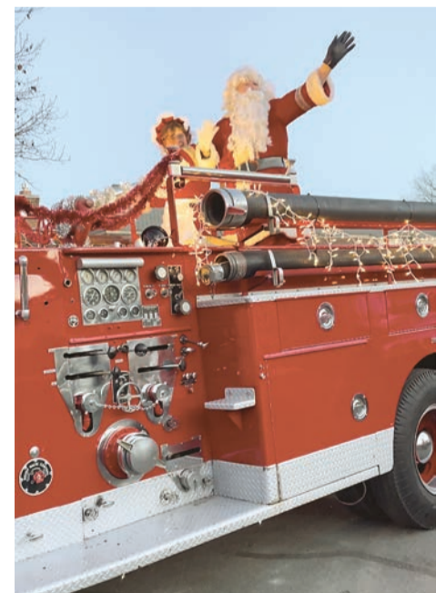
Santa and Mrs. Claus wave to the children.