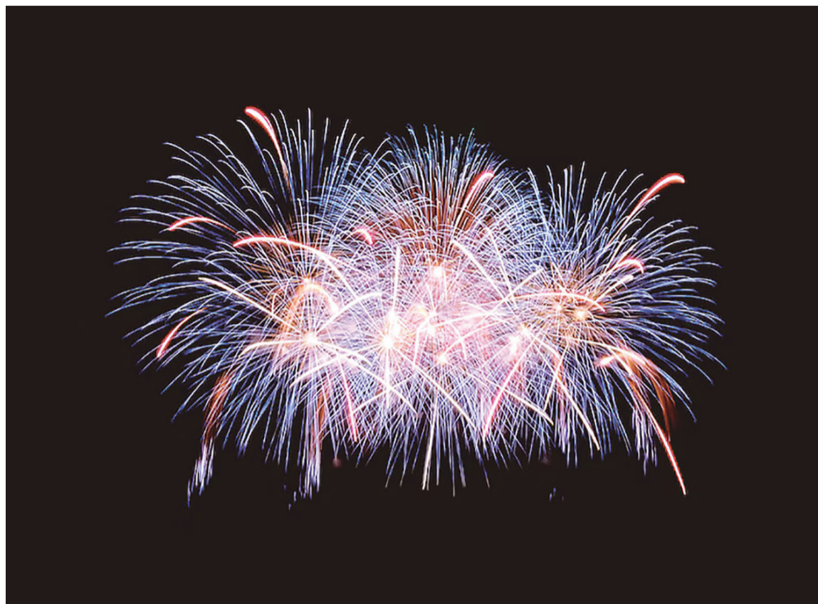
Independence Day Fireworks will begin on June 30 and July 1 around the region.

Independence Day at Lake Fairfax Park. At 1400 Lake Fairfax Drive, Reston. Ticketed entry to Lake Fairfax Park begins at noon, and the park will close to new arrivals at approximately 8:45 p.m. Parking fees are $15 per vehicle in advance or $20 per vehicle at the gate. Bicyclists and pedestrians are free. Lake Fairfax is a destination location providing 476 acres of parkland. You'll find a wide range of family friendly activities. Visitors can enjoy the Water Mine Family Swimmin' Hole water park, skate park,