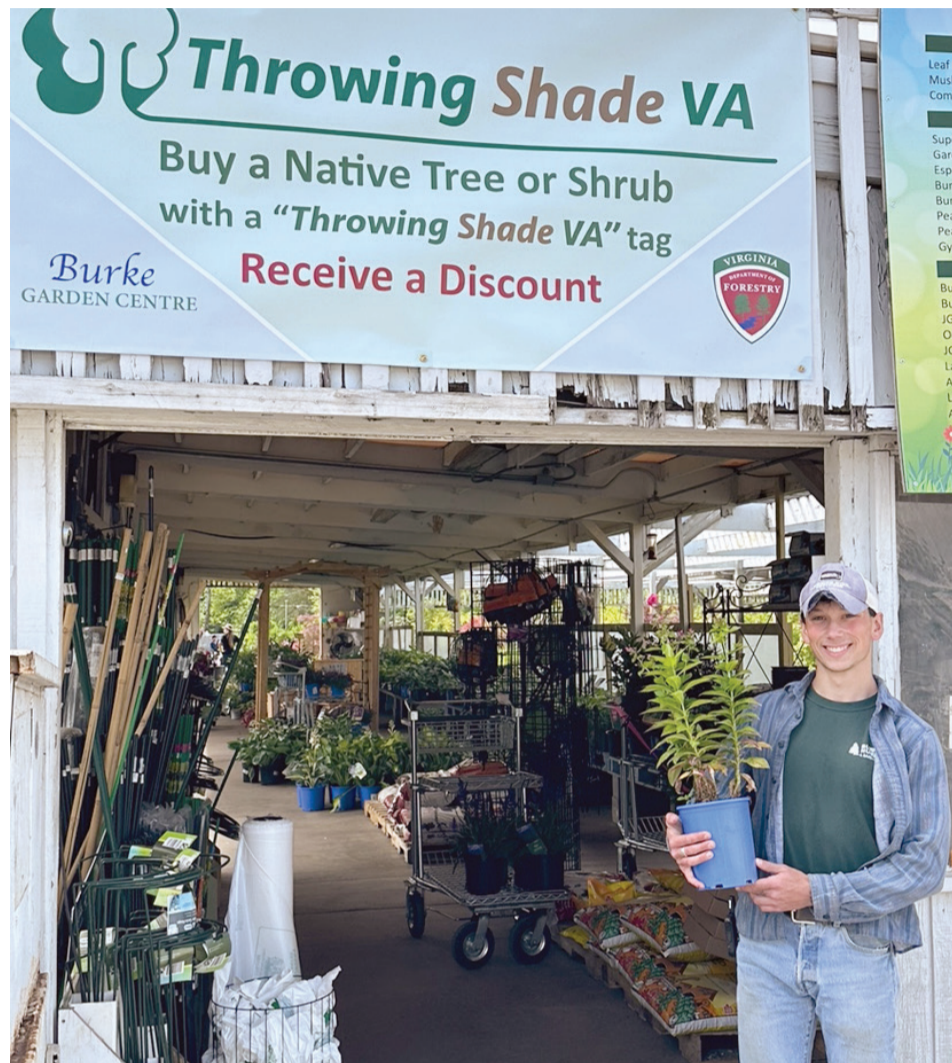
Burke Nursery & Garden Center is one of three nurseries state-wide offering the Throwing Shade VA pilot program.

to those limits. Virginia’s Water Implementation Plan, also called the Clean Water Blueprint, requires an increase of tree canopy coverage for the health of the Chesapeake