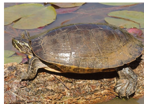
A female Eastern River Cooter turtle, like this one, soon found the renewed central garden of the park a good place to lay her eggs.