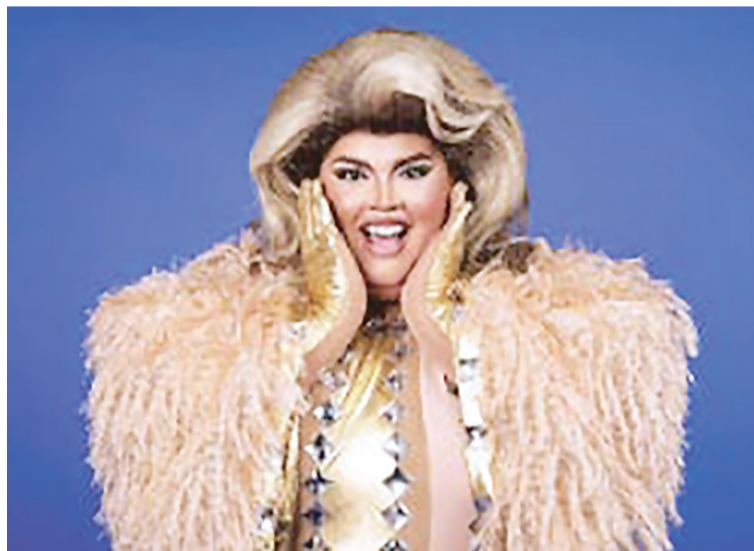
Pride Night Out will be held on Friday, June 23, 2023 at Springfield Town Center.