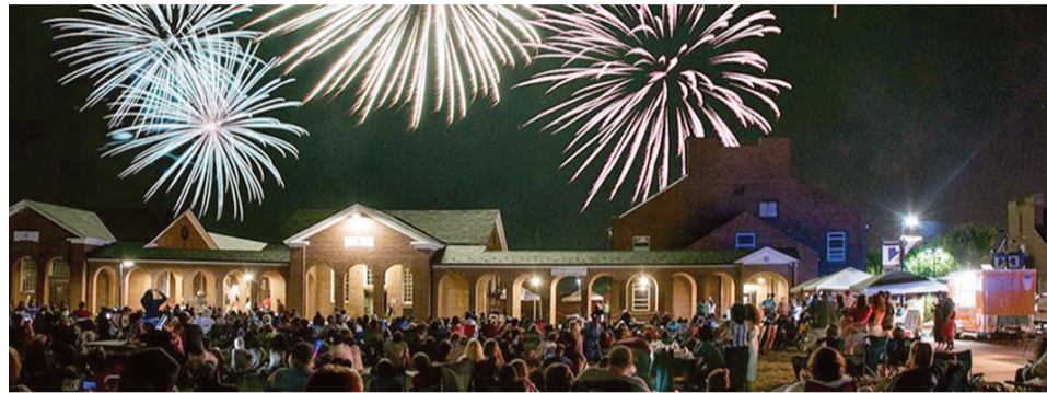
FireWorks 2023, 6-10 p.m., Workhouse Quad. For tickets see https://www.workhousearts.org/calendar/fireworks

The County's FREE Mount Vernon Nights Concert Series features local entertainers and a wide array of musical styles at 7:30 p.m. on Fridays at Grist Mill Park and Saturdays at the Workhouse Arts Center. The National Park Service also offers free concerts at Fort Hunt Park on Sundays throughout the summer. The Workhouse continues its Saturday Community Markets and our Farmers