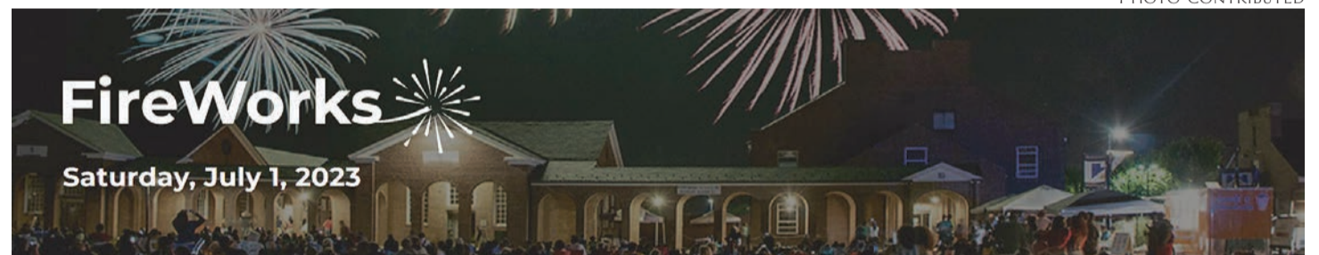
At the Workhouse Arts Center in Lorton, they are having a pre-July 4th show this year, Saturday, July 1. See the calendar on page 8 for other local fireworks, including Mount Vernon, Vienna, Great Falls, Reston and more.

Since even the possession of unapproved fireworks is prohibited in Fairfax County,