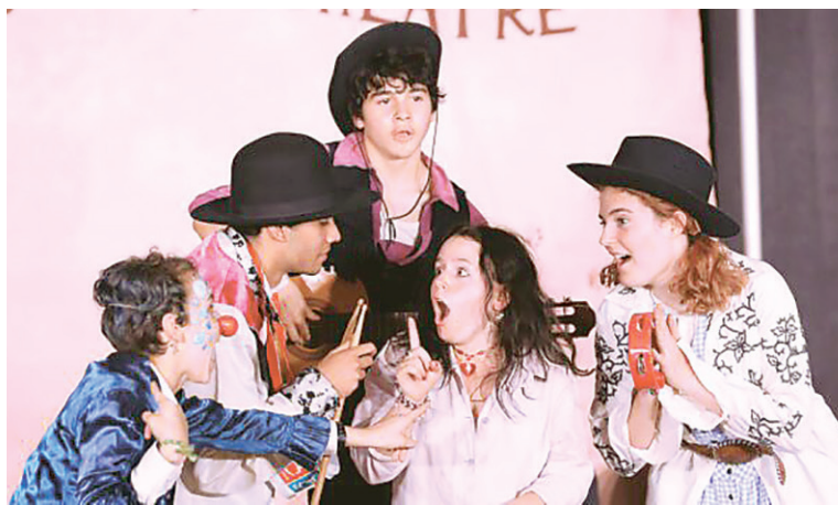
The Traveling Players will present "Romeo & Juliet" at Tysons Corner Center Plaza July 27 to Aug. 2, 2023.

Jul. 27 – Aug. 2 – at 7 p.m. – "Romeo & Juliet"