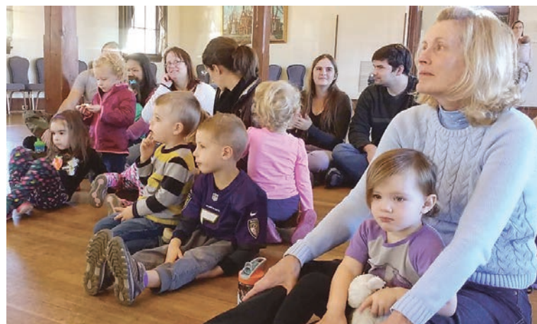
Funday Monday will be held July 31 to August 28, 2023 in the heart of Fairfax City.

Enjoy an all-new season of family-friendly entertainment at the Starlight Cinema at Trinity Centre, in Centreville, every Saturday evening in August. Come to watch the movies "drive-in" style from your car or bring chairs and blankets to watch from the lawn. As part of the Summer Entertainment Series, the Starlight Cinema