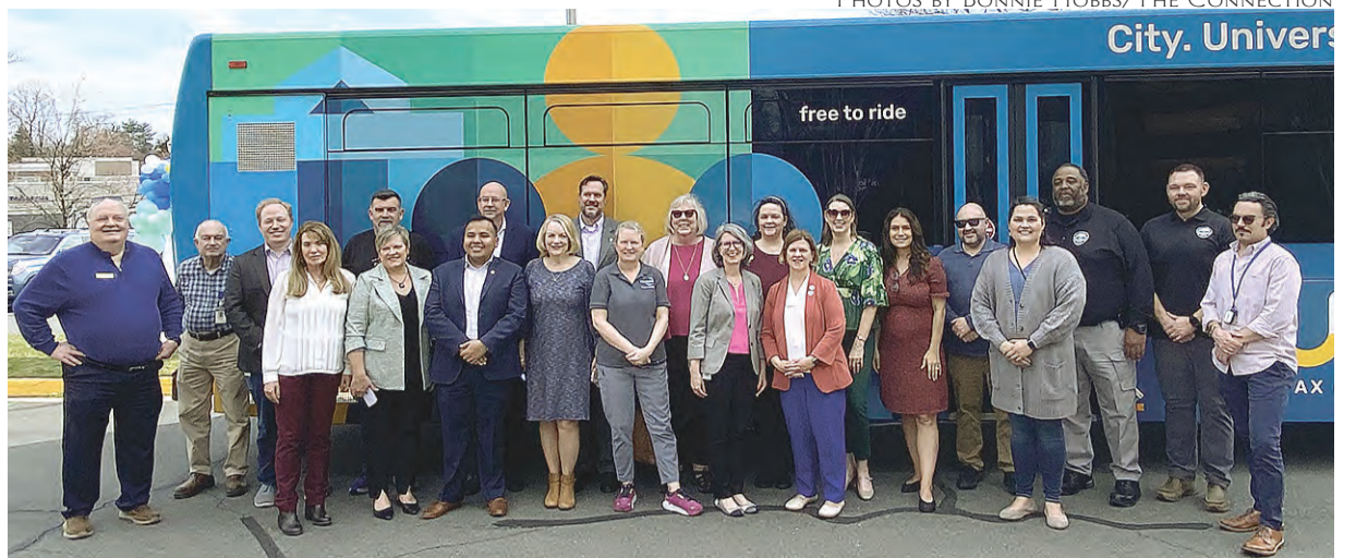
Ceremony participants gather in front of one of the newly wrapped CUE buses.