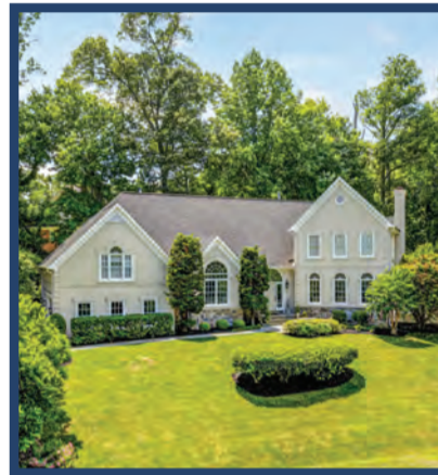
Great Falls $2,450,000