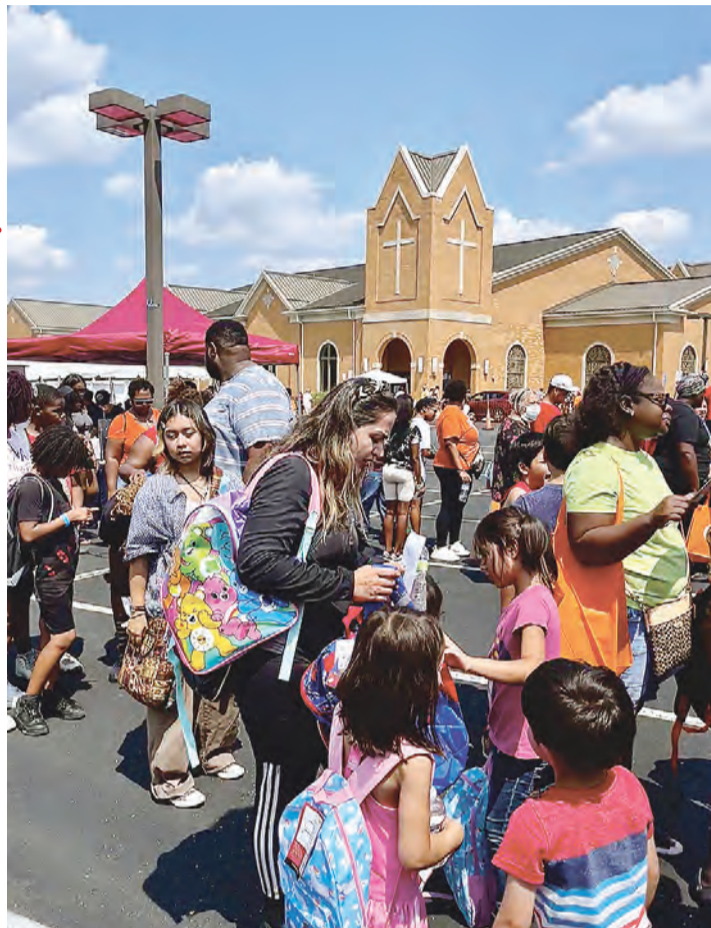
A very small portion of the nearly 3,000-person crowd can be seen at the first Back-to-School Festival held by Mount Olive Baptist Church in Centreville. Organizers plan for the festival to be an annual event.