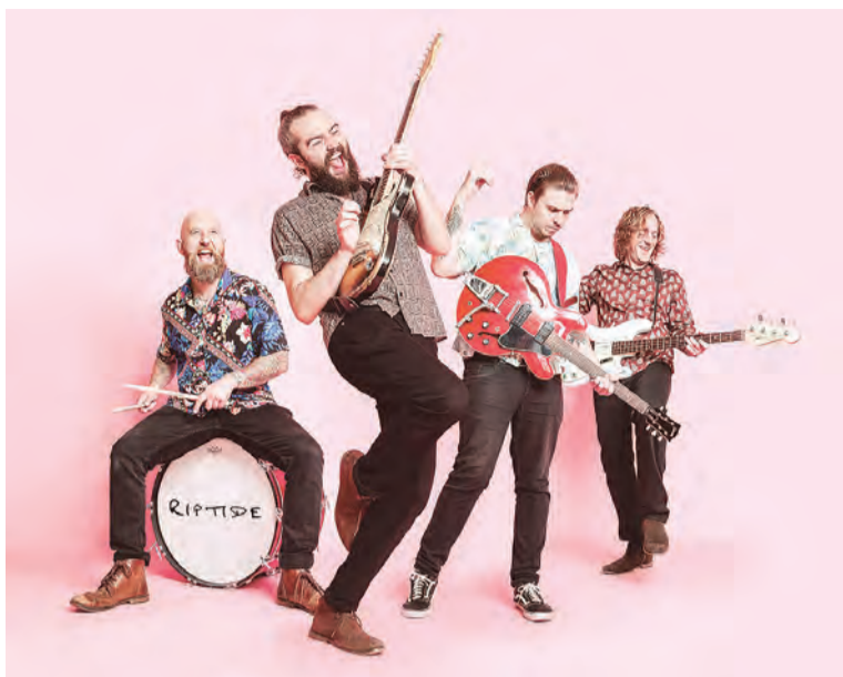
The band Riptide will play on Aug. 21, 2024 at the Free Concerts at Burke Lake Park at 7 p.m.