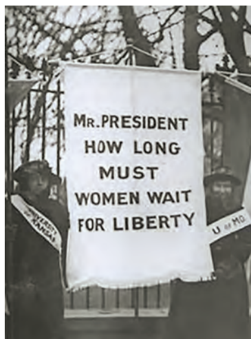
A Women's Equality Celebration takes place on Saturday, Aug. 24, 2024 at Workhouse Arts Center in Lorton.

Oakmont, Through Nov. 6, 8 a.m. - noon, Oakmont Recreation Center, 3200 Jermantown Road, Oakton