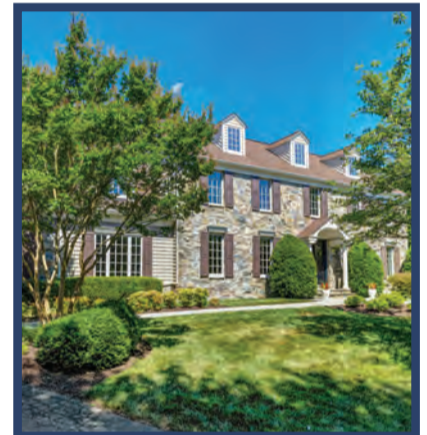
Great Falls $2,399,000