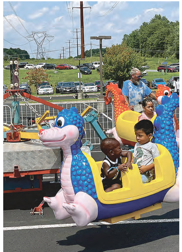
It can be a little scary for a young one to ride a sea serpent.