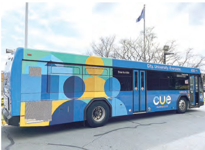
A close-up look at a cheerful and colorful CUE bus.