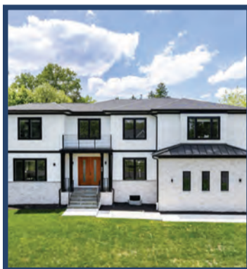
Great Falls $2,698,000