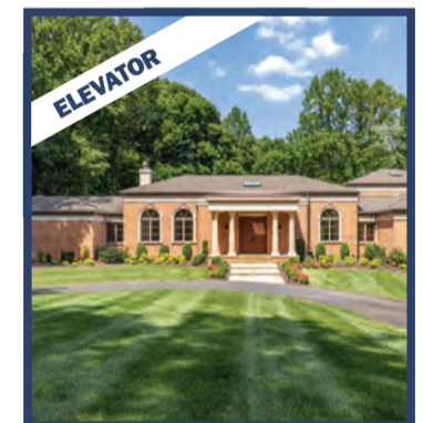
Great Falls $2,599,000