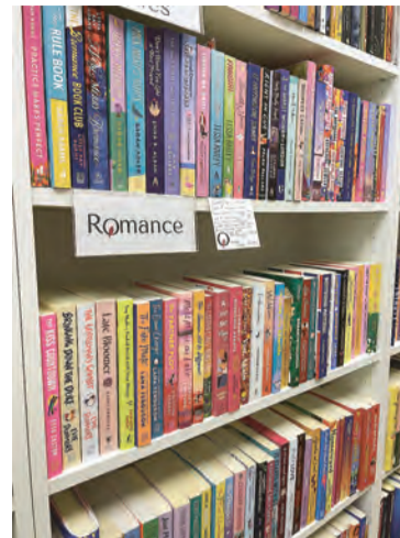
Bookstore Romance Day takes place on Saturday, Aug. 17, 2024 at Fonts Books & Gifts in McLean.

ing kid favorites: a backhoe, dump truck equipped with a plow, and a vacuum truck, accompanied by other surprise vehicles.