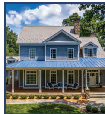
Great Falls $2,999,999