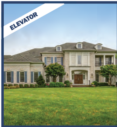
Great Falls $2,999,999