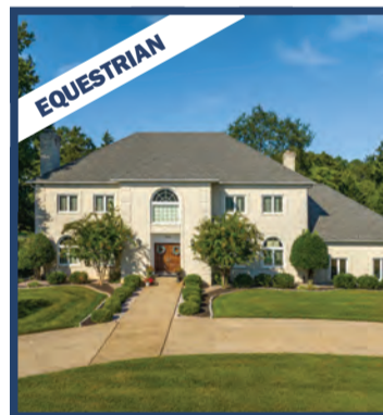
Great Falls $2,099,000