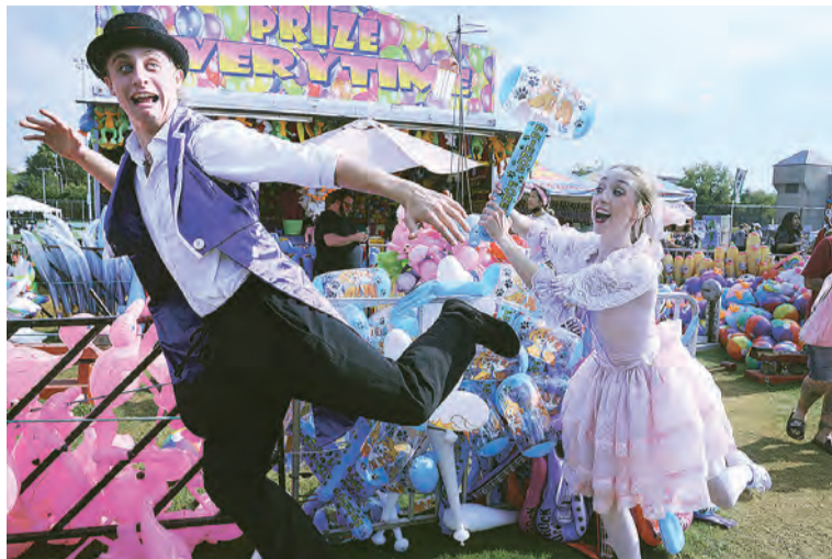
The 48th Annual Arlington County Fair takes place Aug. 14-18, 2024 at the Thomas Jefferson Community Center and Park in Arlington.

Mark your calendars for 7 p.m. every Wednesday night through Aug. 21st at Burke Lake Park for an incredible line-up of