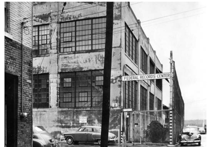
The U.S. Naval Torpedo Plant was converted to a storage facility for federal records, which were held there from 1950-1968.