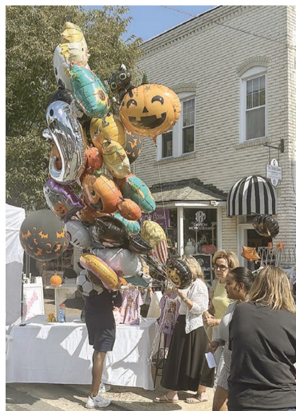
A balloon street vendor at Art on the Avenue.