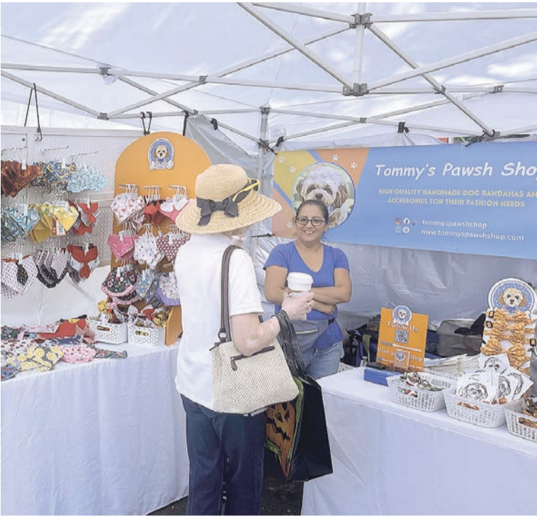
Vendors featured arts and crafts for pets Oct. 5 at Art on the Avenue.