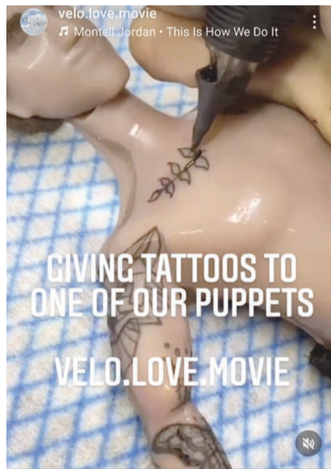
Placing a real tattoo on a puppet figure in "Velo Love."