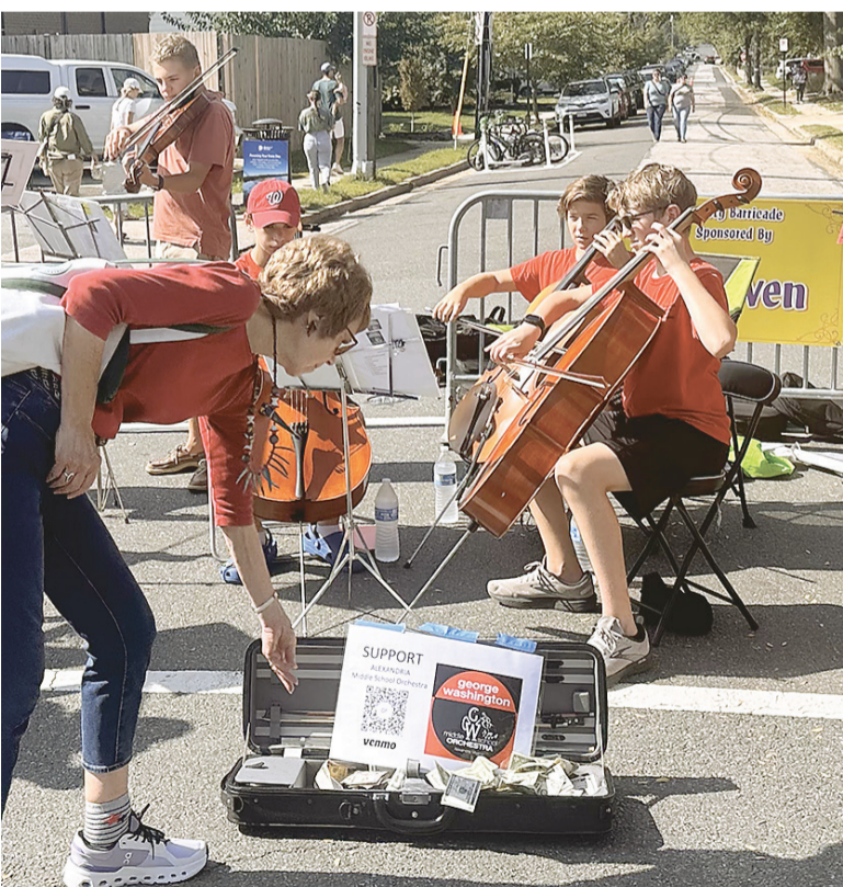
Musicians from the George Washington Middle School orchestra perform Oct. 5 at Art on the Avenue.