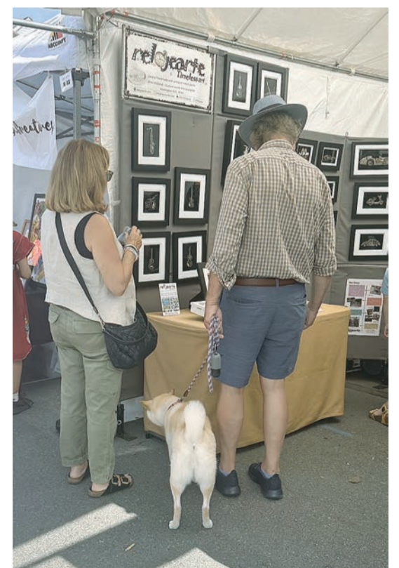
Art created with antique watch parts at Art on the Avenue.