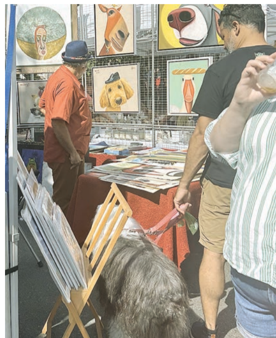
Visitors enjoy some of the art available at Art on the Avenue Oct. 5 in Del Ray.