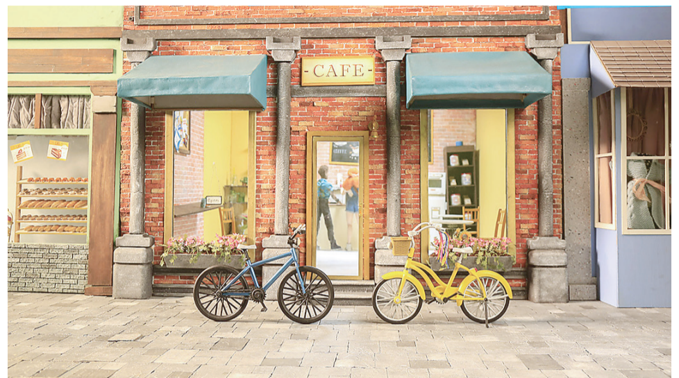
Set of animated film "Velo Love"

A. There were a lot of decisions with the animation because we were creating it all. What does the cafe look like, the characters?