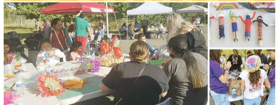
Chirilagua Neighborhood Arts Day takes place on Saturday, Oct. 12, 2024 in Alexandria.

Alexandria. Woodlawn & Pope-Leighey House provide a unique opportunity to put two American styles of architecture – separated by over a century – in conversation with one another. Take a close look at both houses to examine what it was that the architects who built these homes were trying to convey about the people who lived here, the period they lived in, and what they thought the future held. Visit the website: