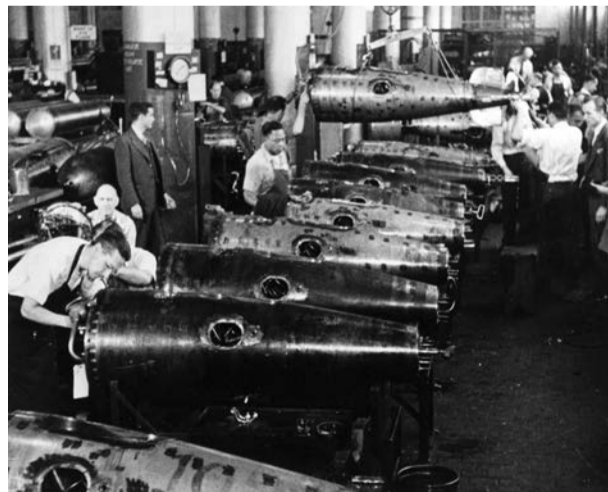
Shop workers at the U.S. Naval Torpedo Station in Alexandria adjust and overhaul torpedo afterbodies during World War II.