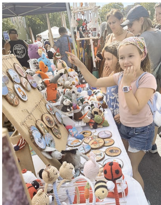
A young girl points at her favorite art objects Oct. 5 at Art on the Avenue.