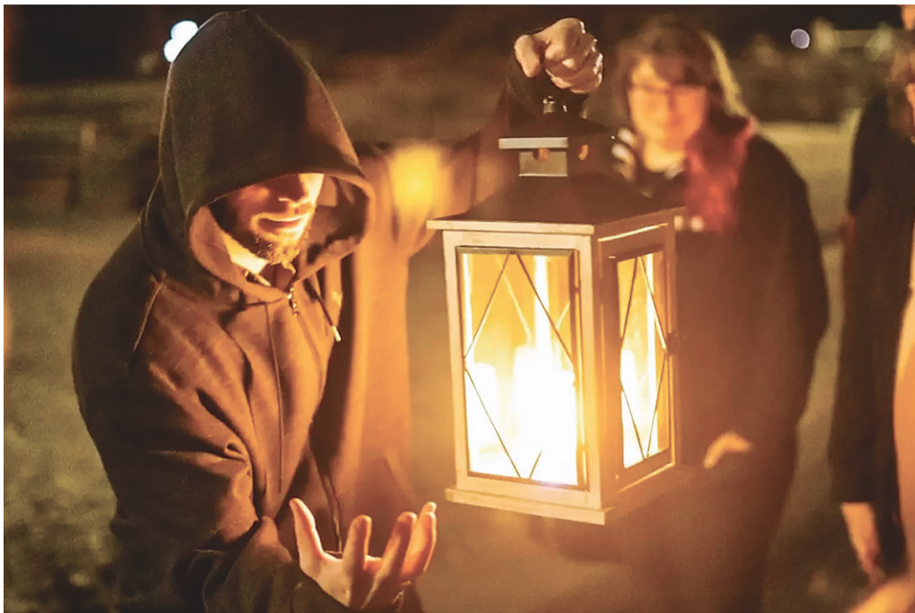
Alexandria Ghost Tours and Haunted Pub Crawls have started at various locations in Old Town Alexandria.