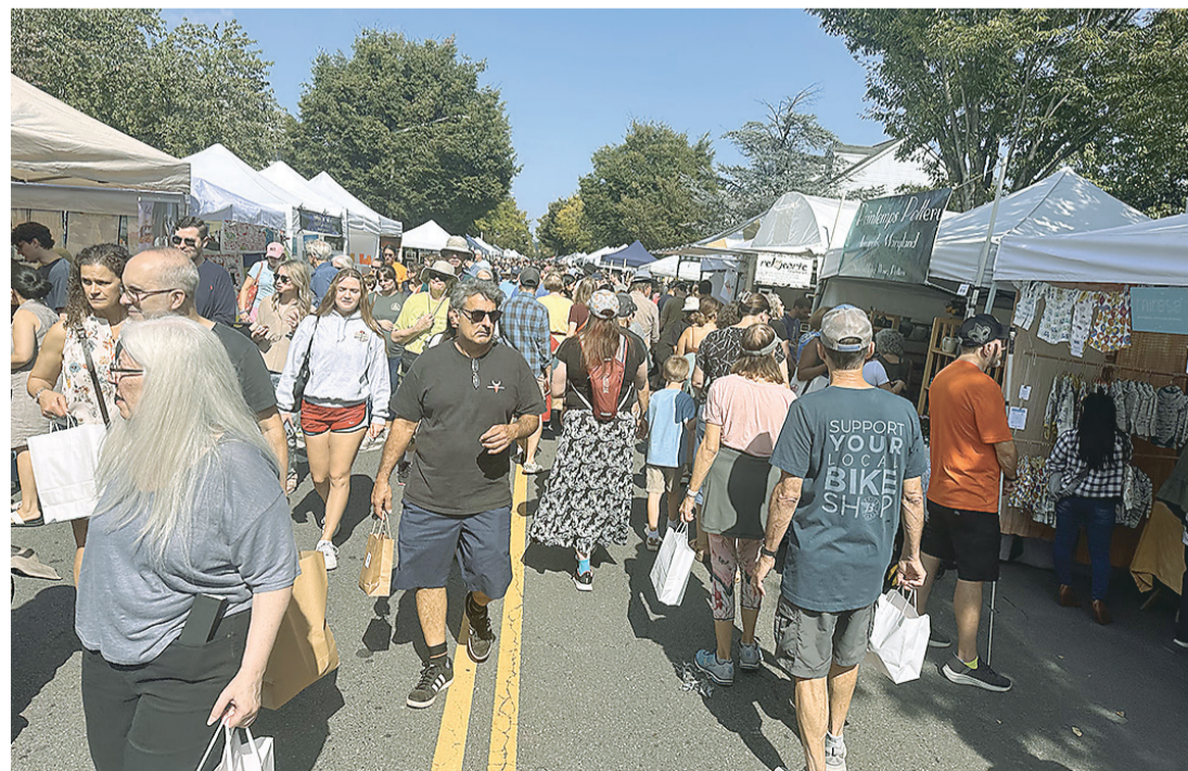
Art on the Avenue attracted more than 50,000 visitors to Del Ray.

Held each year on the first Saturday in October SEE 20TH ART ON THE AVENUE, PAGE 6