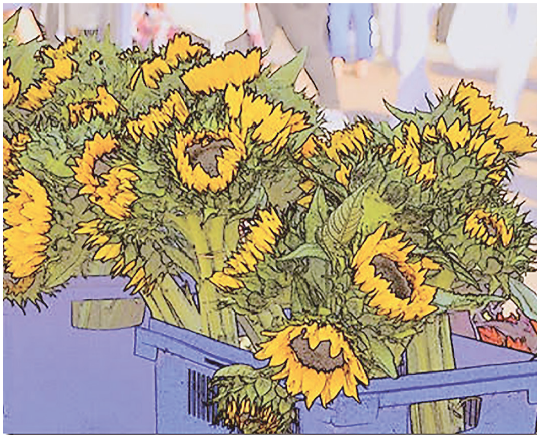
"A Focus on Nature" can be seen Oct. 24 to Dec. 21, 2024 at Coldwell Banker Realty in Alexandria.

11 a.m. to 3 p.m. At Various locations in Old Town Alexandria. Bring the family and enjoy trick-or-treating in various shops and restaurants in Old Town along upper and lower King Street and select side streets. Visit oldtownbusiness.org in the coming weeks for details on the starting point and map pick-up location.