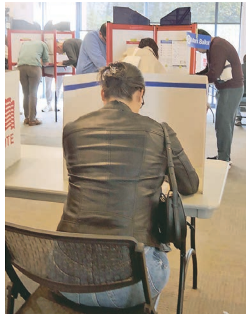
The voting booths are full at Central Library mid-morning but with a smooth progression of voters and little wait.