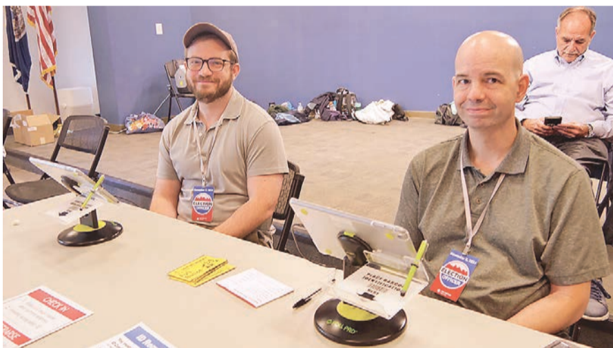
Election officers waiting for next voters at Central Library polling place.