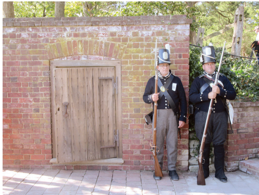
At the Oct. 17 event, members of the Maryland Society of 1812 posted the colors at the tomb.