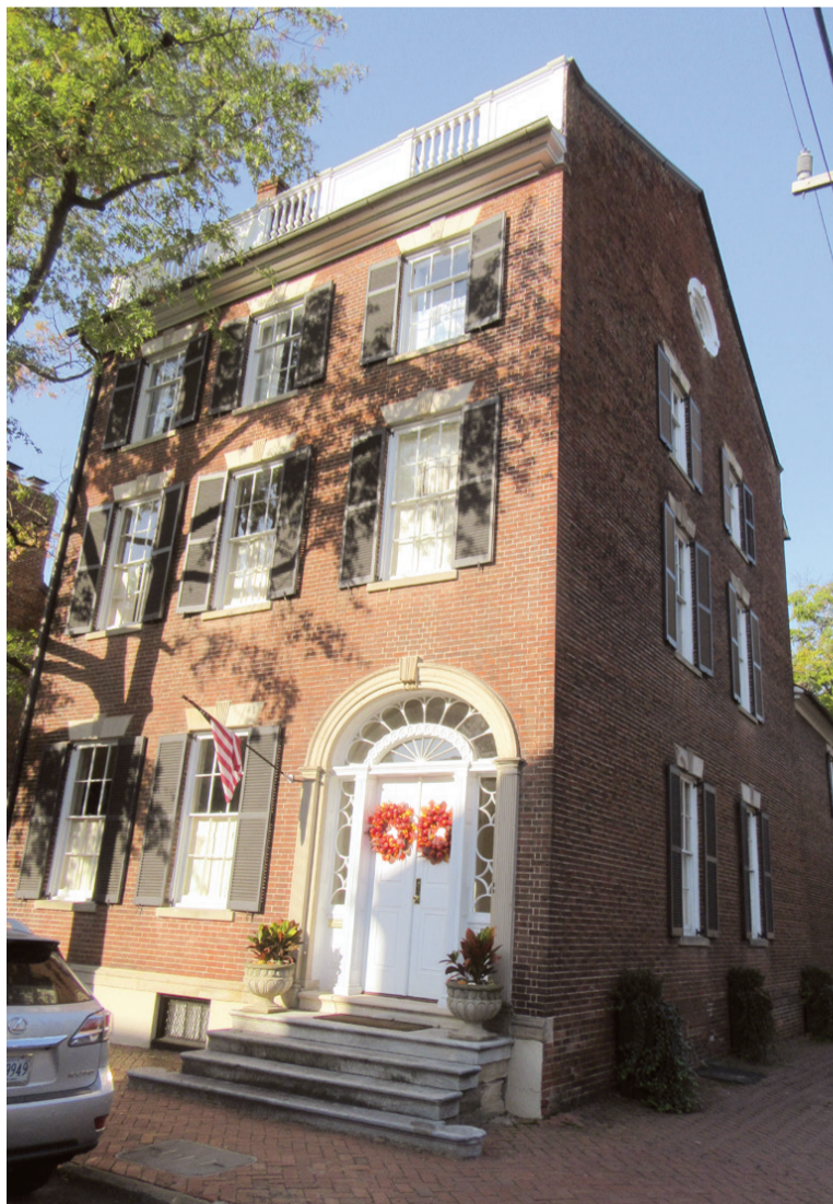
Lafayette spent the night at 301 South St. Asaph Street in Alexandria, before going to Mount Vernon.

The Parkinson's Disease Support Group of Alexandria meets the 1st Wednesday of each month at 2 p.m. At the Hollin Hall Senior Center, Room 109, 1500 Shenandoah Road. All Parkinson's patients and caregivers are welcome.