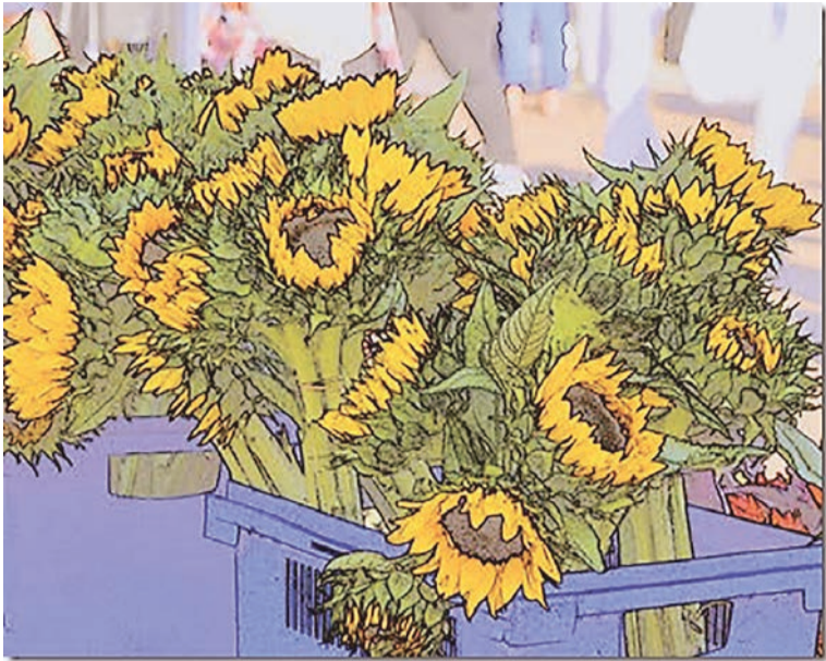
“A Focus on Nature” can be seen Oct. 24 to Dec. 21, 2024 at Coldwell Banker Realty in Alexandria.