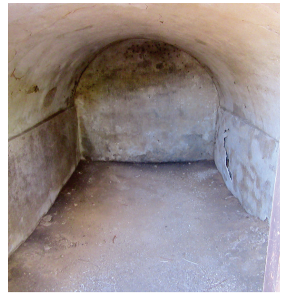
Inside the tomb. A sign says that 20 people were buried here.