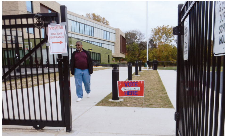
The new Douglass MacArthur building awaited voters on election day.