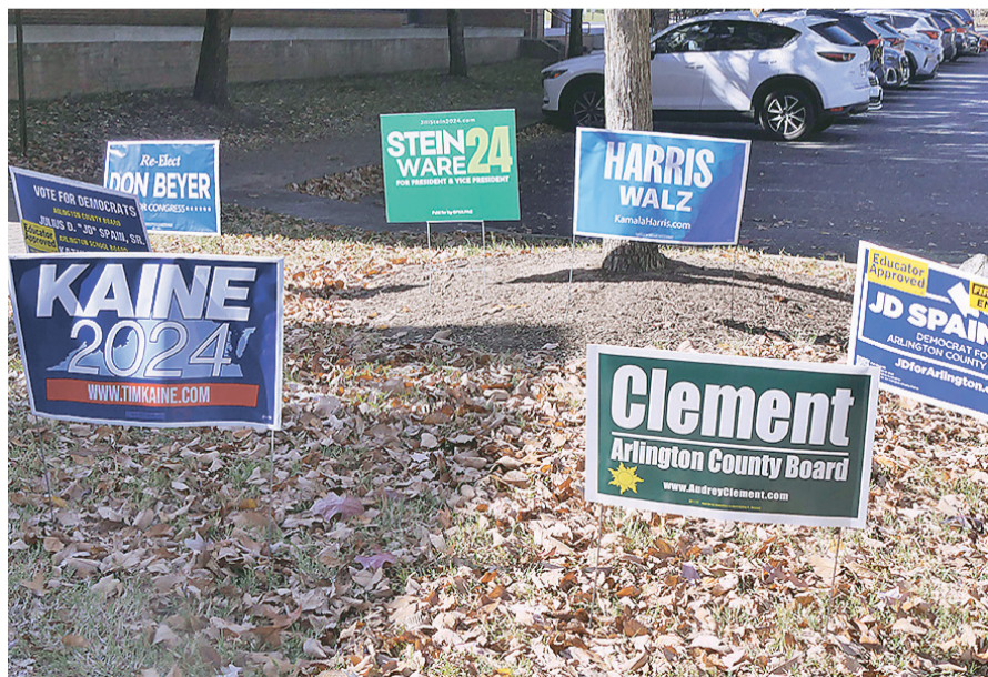
Signs outside the library represent the spectrum of choices at the 2024 election.