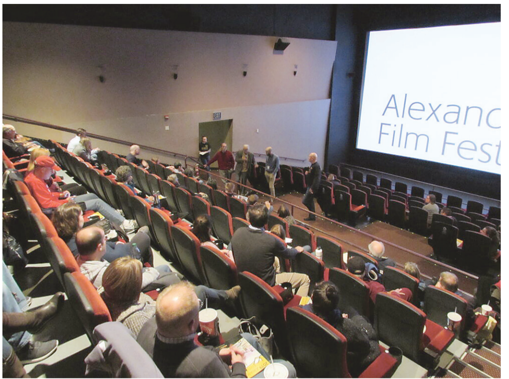
The 18th Annual Alexandria Film Festival runs Nov. 7-10, 2024 in Alexandria.