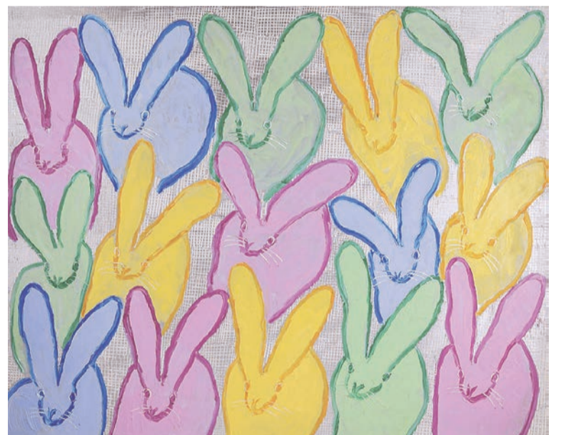
The Nepenthe Gallery is offering original works by Hunt Slonem on Thursday, Nov. 7, 2024, in Alexandria.

Nepenthe Gallery Exhibit. At 7918 Fort Hunt Road, Alexandria. Nepenthe delights in offering original