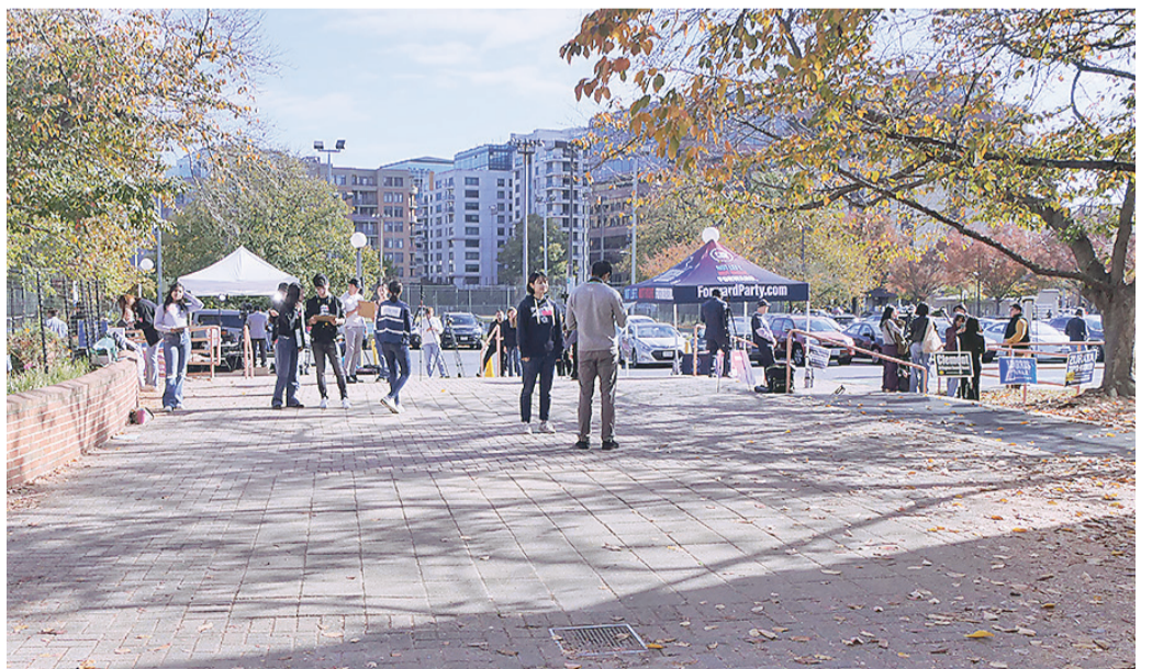
Arlington's Central Library is booming with activity on the morning of Election Day with voters, candidates and media competing for space on the steps outside the door.