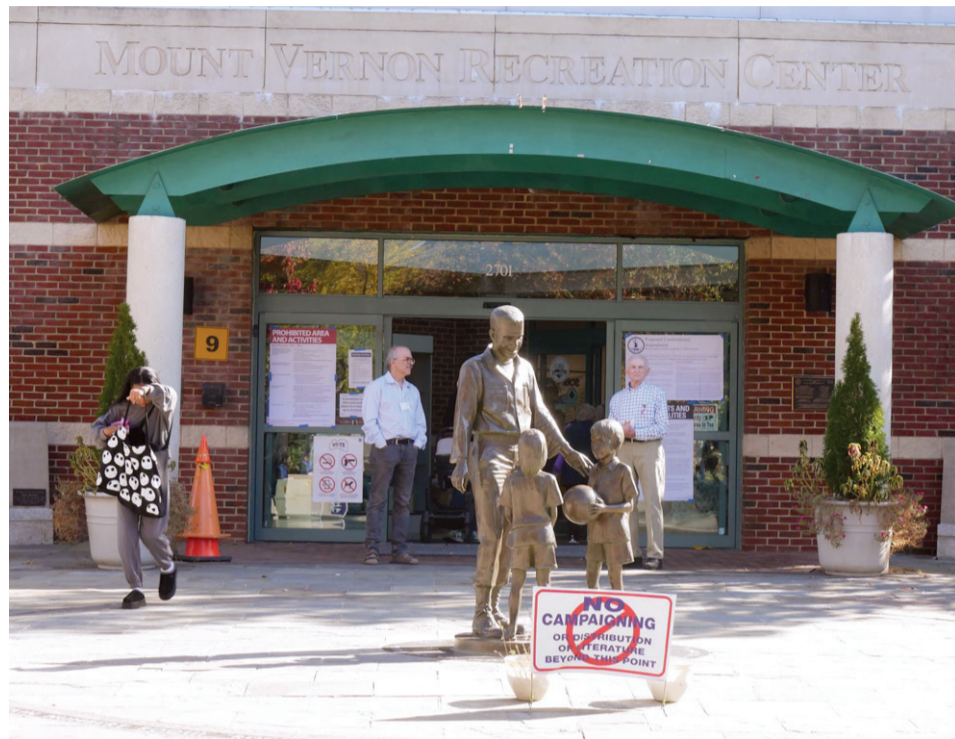
Mount Vernon is typically the city's busiest polling site.

Outside of the Beth El precinct, resident