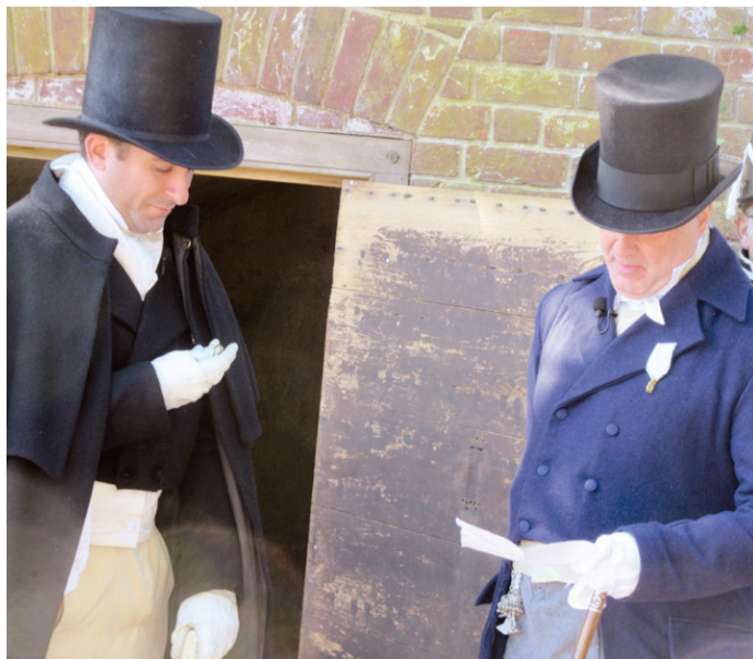
In the re-enactment, Lafayette studied the ring containing a lock of George Washington's hair.