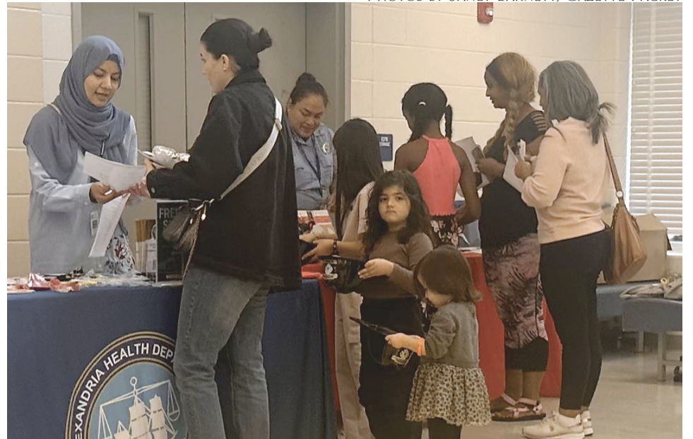
Families receive information on city and nonprofit health programs at Community Resource Day Sept 22 at Patrick Henry Elementary School.