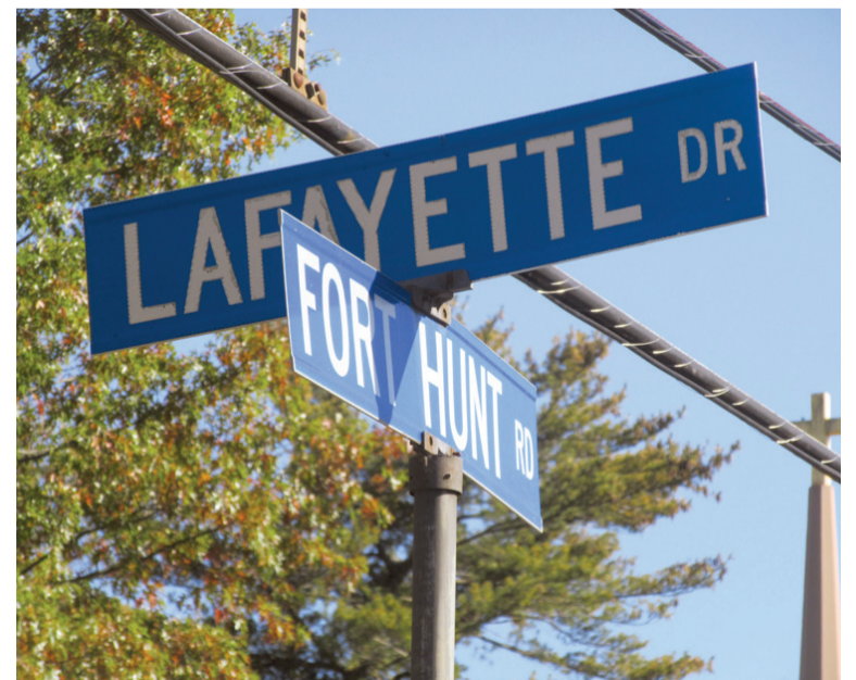
Mount Vernon's Lafayette Drive intersects with Fort Hunt Road.