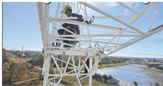
Fairfax County hosts its 1st in-house Tower Rescue Technician Course.

Fairfax County Fire and Rescue Department announced on Nov. 22 that it hosted its first in-house Tower Rescue Technician Course. Tower Rescue Operations Team (TROT) personnel are now qualified to serve as adjuncts for future courses, boosting regional capabilities. According to the department, TROT personnel “respond to complex and challenging rescue incidents including high-angle incidents on cranes, cliffs, high-rise buildings; confined space incidents in tunnels, tanks, sewers, buildings and trenches; and swift water incidents occurring on flooded streams, roadways and within Great Falls Park.