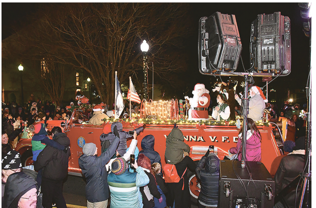
The Vienna Church Street Stroll takes place on Monday, Dec. 2, 2024 in the Town of Vienna.