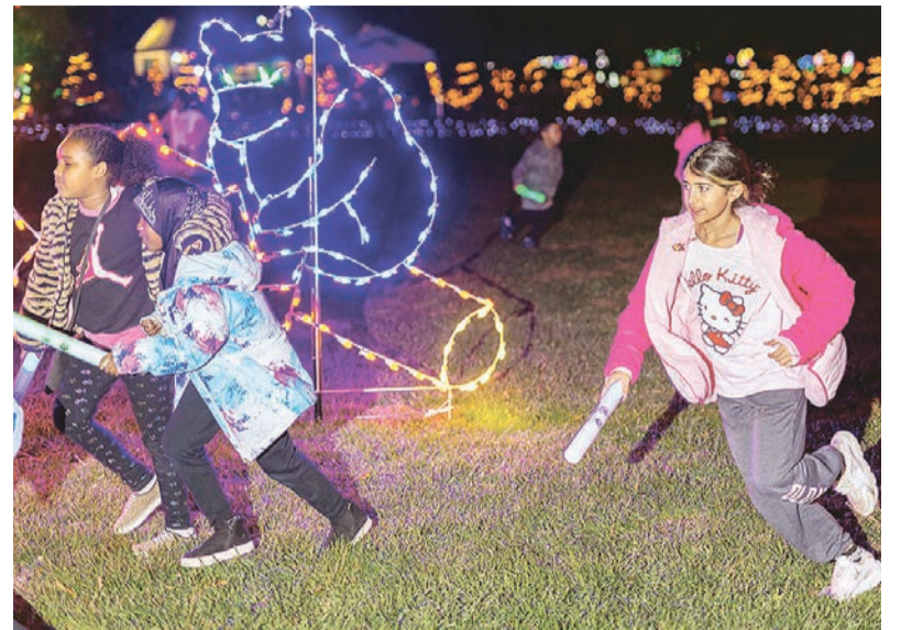
Winterfest takes place Dec. 5-7, 2024 at Brown's Chapel Park in Reston.

Friday from 6-8 p.m. Saturday and Sunday from 10 a.m. to 5 p.m. Explore three festive locations filled with incredible art, perfect for gifting or treating yourself this holiday season. Just look for the Nutcrackers to guide you. At the following three locations: ❖ The Grange, 9818 Georgetown Pike; ❖ The Artists Atelier, 756 Walker Road; ❖ The Artists on the Green, 776 Walker Road.