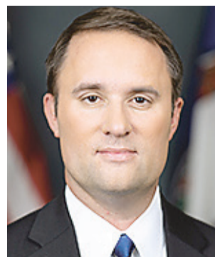
OFFICE OF THE ATTORNEY GENERAL Jason S. Miyares, Attorney General of Virginia