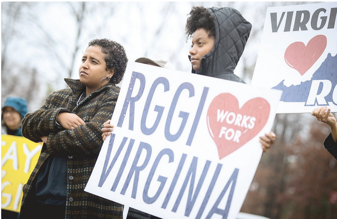
SCREENSHOT INSTAGRAM SOUTHERN ENVIRONMENT

A circuit court judge has ruled that the decision to pull Virginia out of a successful climate program known as RGGI, or the Regional Greenhouse Gas Initiative, was unlawful