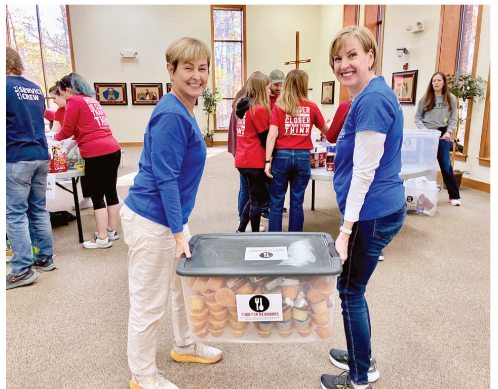
Members of Social4Good, an organization that promotes volunteerism, understand that many hands make light work. They helped to receive and sort food and toiletries bound for Herndon and Reston area schools.