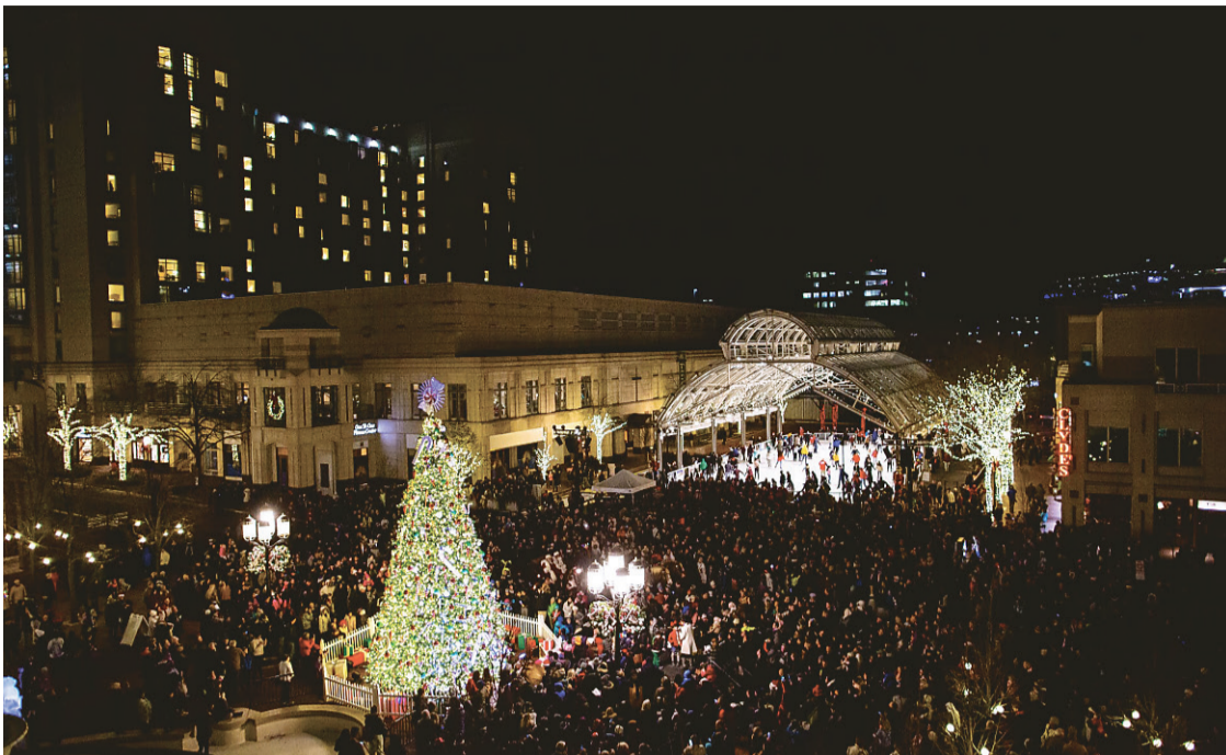
The Reston Town Center Holiday Parade and Tree Lighting takes place on Friday, Nov. 29, 2024 at Reston Town Center.

and societal expectations, delving into themes of identity, resilience, and the enduring power of human connections.