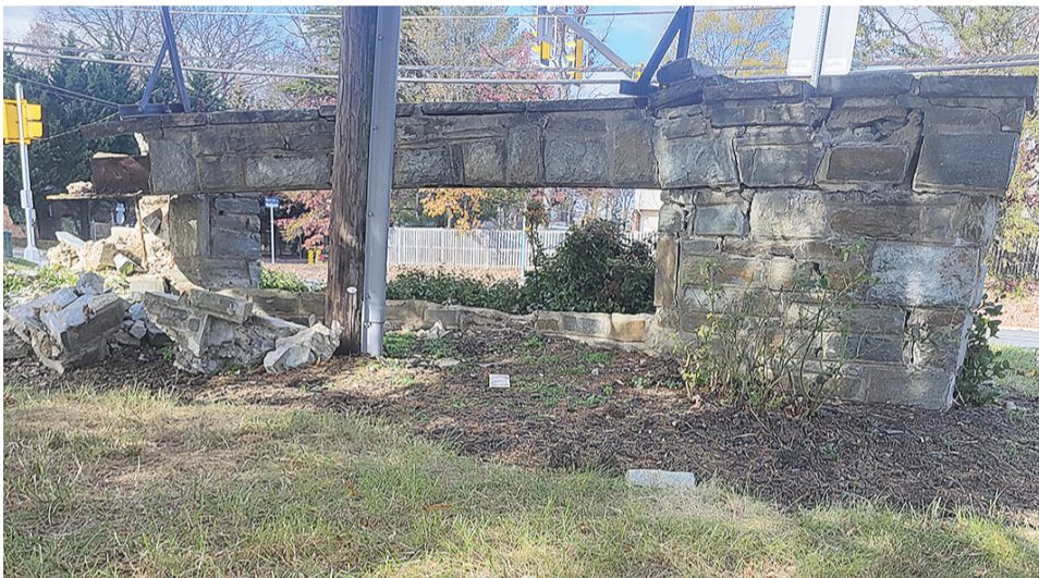
From the back, a wine bottle adds to the impact of the whole thing.