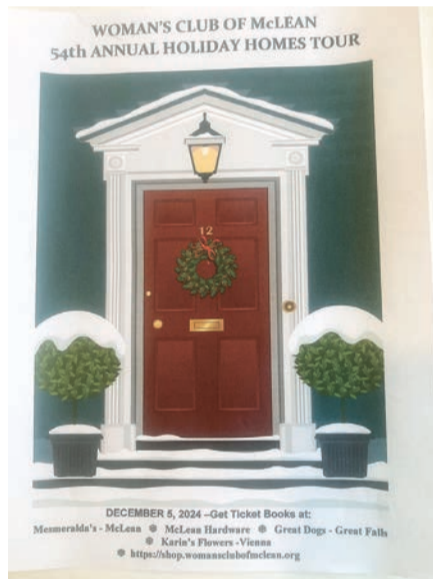
The 2024 Holiday Homes Tour sponsored by The Woman's Club of McLean takes place on Thursday, Dec. 5, 2024 in McLean.

Embrace the spirit of yesteryear with festive activities at this historic site. Join us for lantern tours, a children's holiday shopping experience and meet Santa himself! Holiday Lantern Tour: Dec. 6-7, 5:30 or 6:30 p.m., $12 Children's Holiday Shopping at Historic Colvin Run: Dec. 7-8, 11 a.m.-2:30 p.m., $7 Santa at the Mill: Dec. 14 (3-5:30 p.m.) & Dec. 15 (2-4:30 p.m.), $10 Sensory-Friendly Santa at the Mill: Dec. 14 (12:30-2:15 p.m.) & Dec.