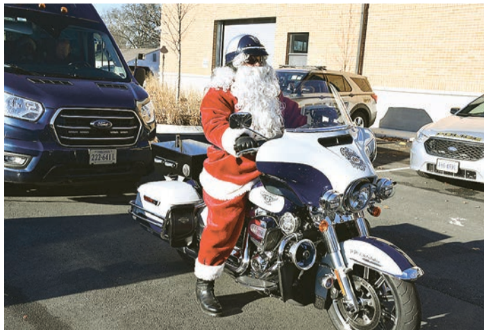
The Vienna Police Santa's Ride 2024 takes place on Tuesday, Dec. 10, 2024 in Vienna.

to 1:30 p.m. At The Winery at Bull Run, Centreville. Join in a delightful day of creativity and relaxation as you learn to paint the charming "Winter Barn" scene on your own blank canvas while sipping on delicious Bull Run Wines.