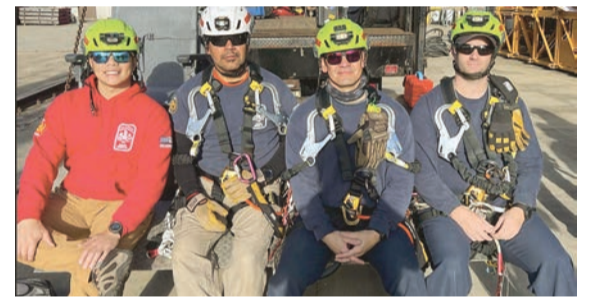
Geared up for TROT training, Technical Rescue Operations Team