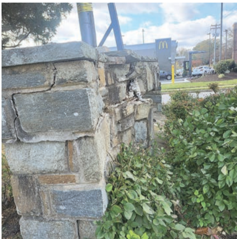
The sign was there a long time before McDonald's.