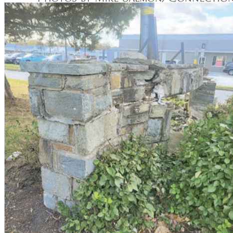
Another look at the damage.