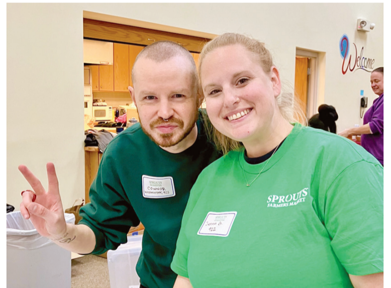
Sprouts team members enjoy volunteering in Herndon as part of their Sprouts Day of Service, an annual, nationwide effort.