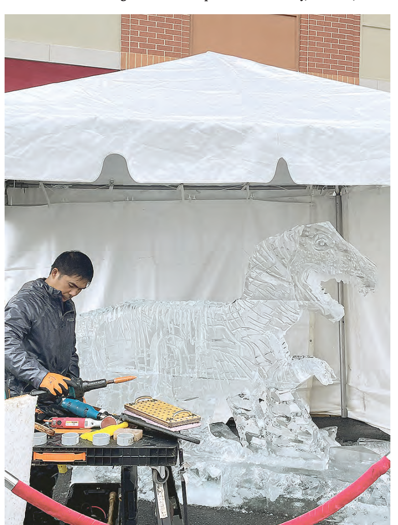
The Village of Leesburg Ice Festival takes place on Saturday, Jan. 25, 2025 off Route 7 in Leesburg.

wines and their origin, and small bites to enjoy during the event.