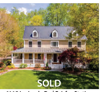
6115 Innisvale Dr. | Fairfax Station $1,500,000