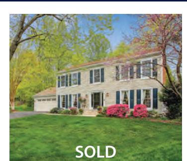
9626 Oakington Drive | Fairfax Station $1,030,000