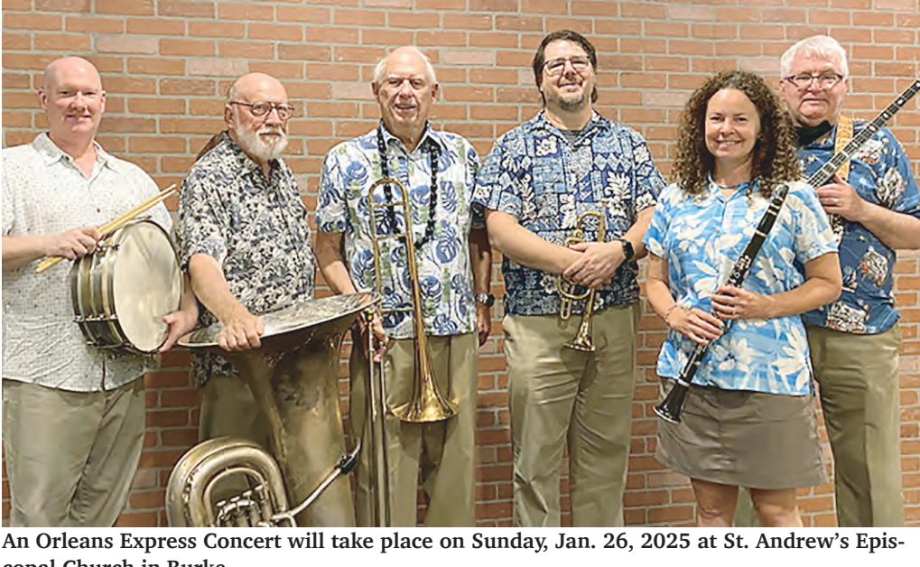
copal Church in Burke.

Orleans Express Concert. 7-8:15 p.m. At St. Andrew's Episcopal Church, 6509 Sydenstricker Road, Burke. Orleans Express (formerly Dixieland Express) has been delighting audiences since it was founded in 1999 to continue the creative sounds of early and mid-twentieth-century jazz. Known as traditional jazz or just plain "Dixieland", the music is straight from the heart of the New Orleans melting pot where immortals such as Louis Armstrong took it to new heights around the world. You will be transported to the fun and magic that is the spirit of the Mardi Gras, and will leave smiling and humming familiar melodies. There is no charge to attend. Visit the website: www.standrews.net