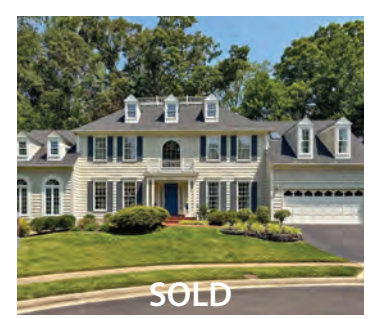
8527 Oak Pointe Way | Fairfax Station $1,265,000