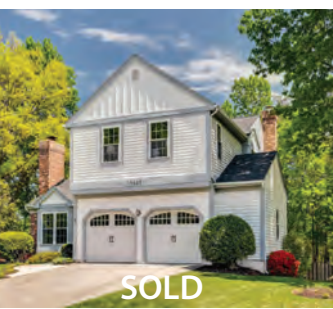
9509 Debra Spradlin Court | Burke $1,050,000