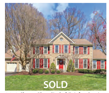
8619 Chase Glen Circle | Fairfax Station $1,312,500