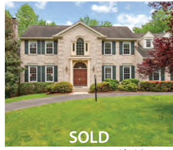
11809 Henderson Road | Clifton $1,215,000