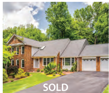
6094 Arrington Drive | Fairfax Station $1,190,500