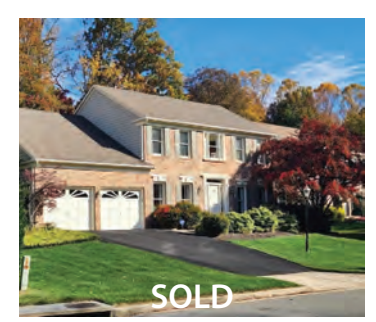
5304 Renaissance Court | Burke $1,225,000