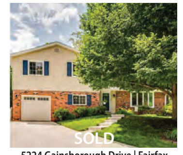
5224 Gainsborough Drive | Fairfax $1,010,000