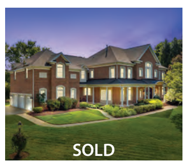
6597 Ellies Way | Fairfax Station $1,735,000