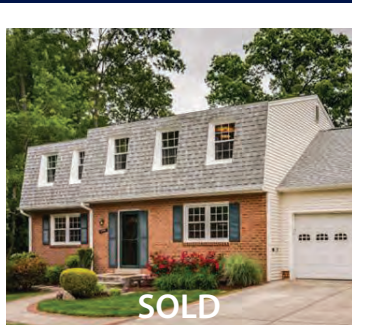
4788 Tapestry Drive | Fairfax $1,025,000