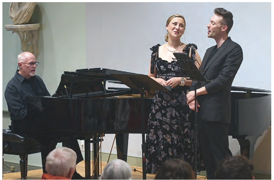
A Concert of Broadway Favorites will be held on Sunday, Jan. 26, 2025 at the Stacy C. Sherwood Community Center in Fairfax.

3529 Chain Bridge Road, Fairfax. The Society of American Magicians (S.A.M 252) presents "A Night of Magic," fundraiser to benefit the Centreville Moose charities. Tickets include a taco bar from 5:45 to 6:45; performance begins at 7 p.m. Features 12 professional and amateur magicians in a full-length performance. Cost: $20 in advance until January 22, $25 at the door