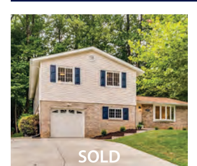
4976 Swinton Drve | Fairfax $1,069,500