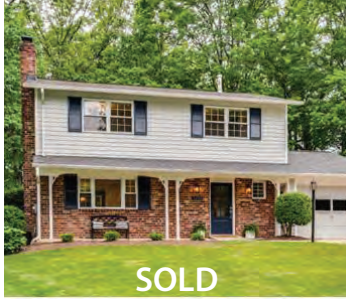
5202 Stern Court | Fairfax $1,127,000