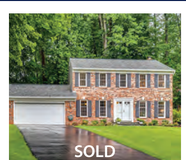
9635 Boyett Court | Fairfax $1,050,000