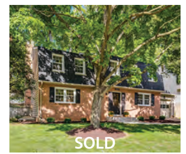
10214 Dundalk Street | Fairfax $1,074,500