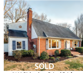
5109 Richardson Drive | Fairfax $1,010,000