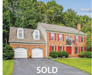
9404 Eagle Trace | Fairfax Station $1,125,000