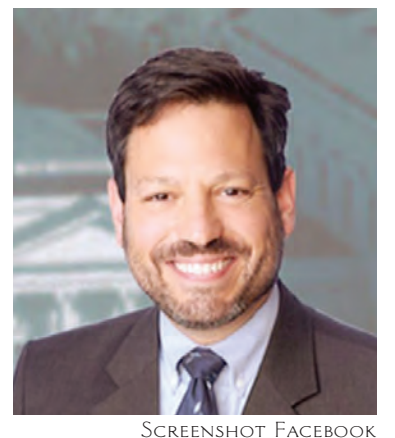
Sen. Scott Surovell (D-34)