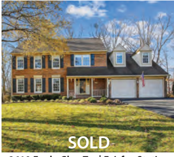
8610 Eagle Glen Ter | Fairfax Station $1,018,000