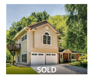
9719 Commonwealth Blvd | Fairfax $1,025,000