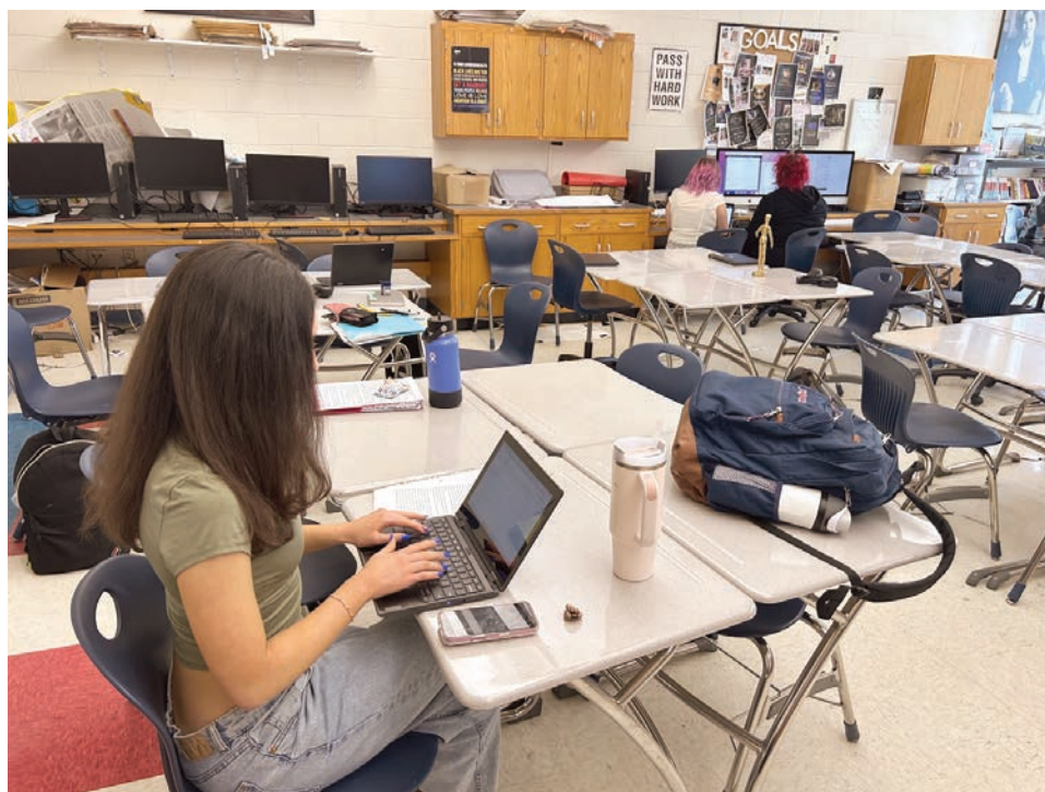
Students say members of the School Board should protect students' First Amendment rights rather than deny them in a policy now under consideration.