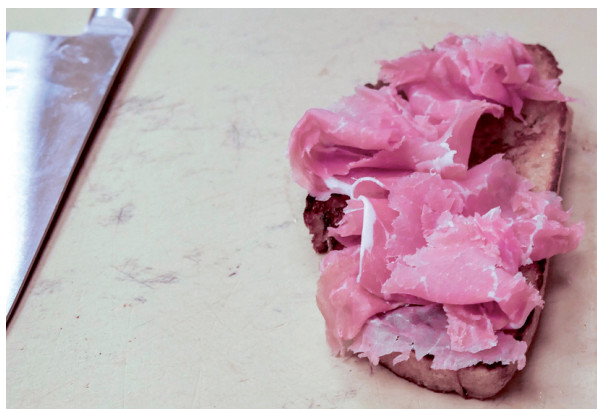
Slices of domestic prosciutto are added to the buttered sourdough