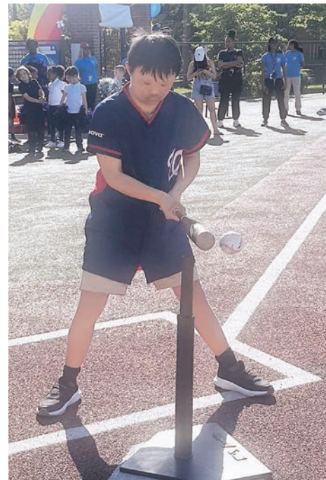
A Miracle League player goes to bat during the MLA game April 23 at the Nannie J. Lee Recreation Center.

For more information or the 2025 season schedule, visit www.miracleleagueofalexandria.com .