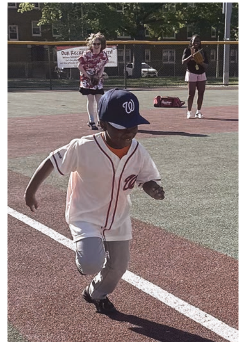
A Miracle League player heads to home after a great hit on opening day for the Miracle League of Alexandria.