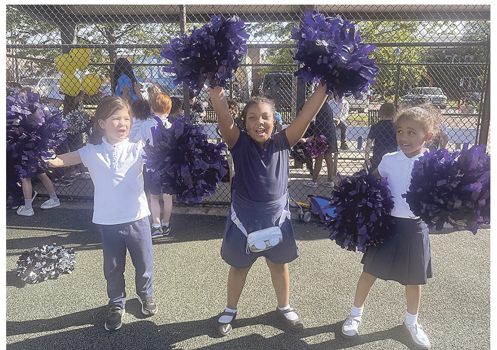
Nannie J. Lee after school program cheerleaders cheer for the Miracle League players April 23 on opening day.