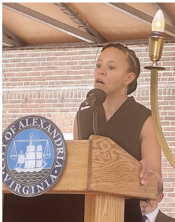
Mayor Alyia Gaskins makes remarks at the Days of Remembrance ceremony April 24 at Market Square.