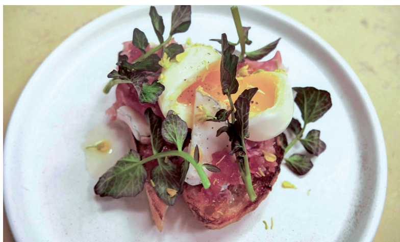
A coddled egg is broken open and placed on the edge of the plate with purple onion marmalade tucked in the crevices. A garnish of purple onions and a sprinkling of mustard blossoms complete the dish.

with three stars from the Washington Post.