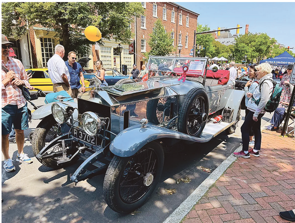
The Old Town Festival of Speed & Style will be held on Sunday, May 18, 2025 in Old Town Alexandria.

Northern Virginia Bird Alliance Birdathon. At Monticello Park, Alexandria. Please consider joining anytime Wednesday, May 14 (Rain date May 15) – you don't have to