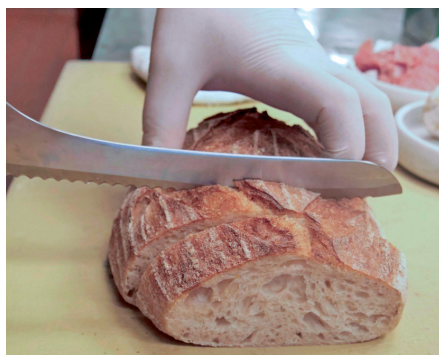
Chittum cuts thick slices of sourdough bread which he will grill in a cast iron skillet