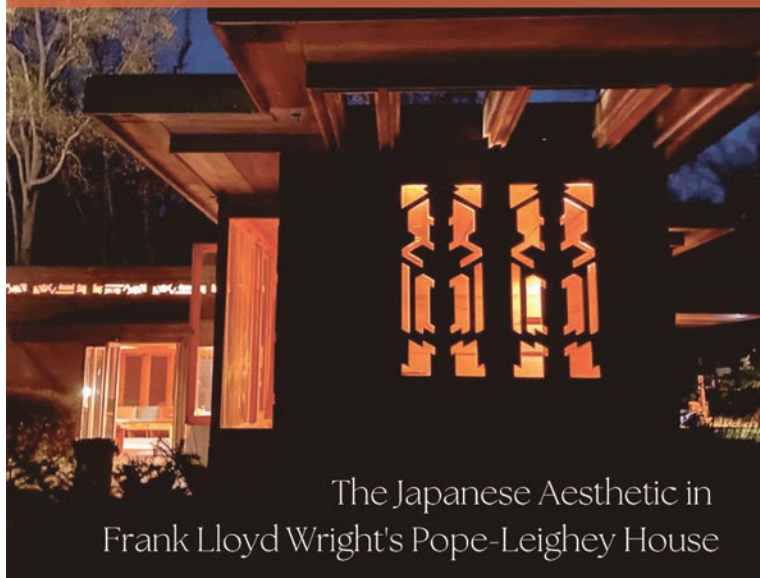
The Japanese Aesthetic in Frank Lloyd Wright's Pope-Leighey House

All Lit Up can be seen on Saturday, May 17, 2025 at Woodlawn & Pope Leighey House in Alexandria.