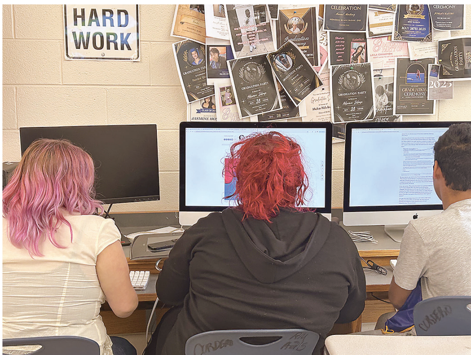
Students journalists at Alexandria City High School are fighting back against a policy proposal that would allow school administrators to silence investigative journalism.