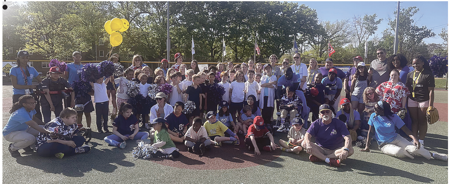
Players and volunteers gather for a group photo prior to the start of the Miracle League of Alexandria game April 23 at the Kelley Cares Miracle Field.