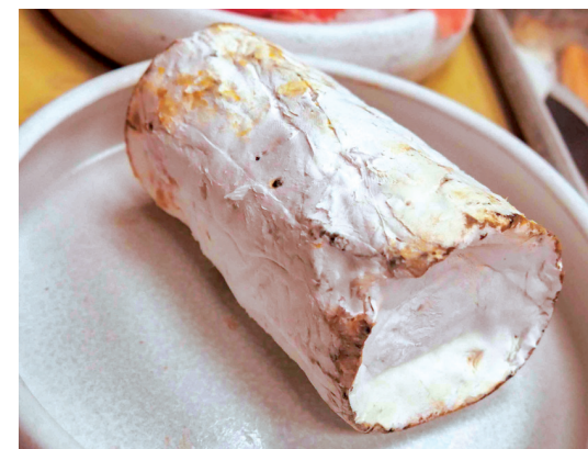
Slices of Goot Essa ash goat cheese are arranged with an artful eye