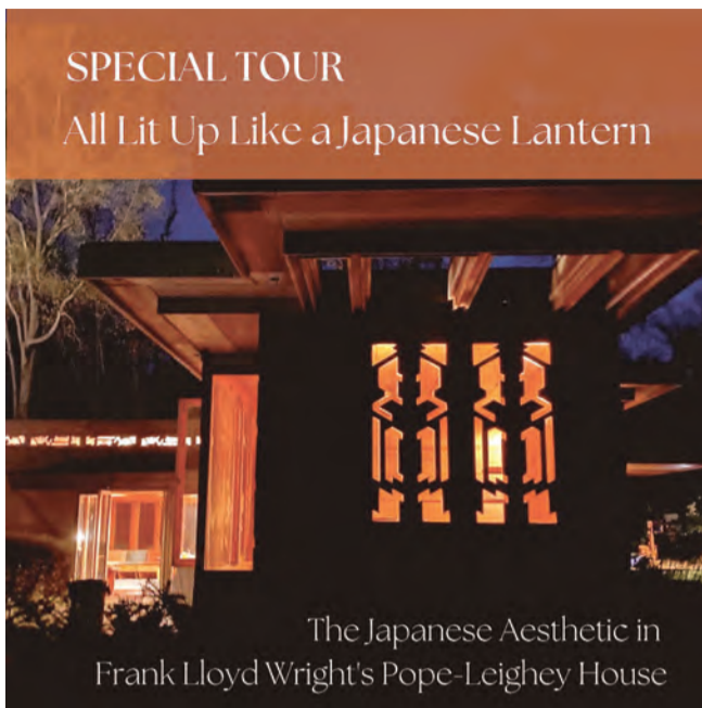
Like a Japanese Lantern takes place on Saturday, June 14, 2025 at Woodlawn & Pope-Leighey House in Alexandria.

Old Town Arts & Crafts Fair. 10 a.m. to 5 p.m. At Waterfront Park, 1 Prince Street on the Potomac River. Presented by Volunteer Alexandria, the fair features local and regional artisans who showcase their pieces across various mediums including pottery, stationery, fabrics, paintings, jewelry, photography and more. Over 90+ vendors joined us last year, including food and drink to purchase. For more information, visit Volunteer Alexandria | Arts