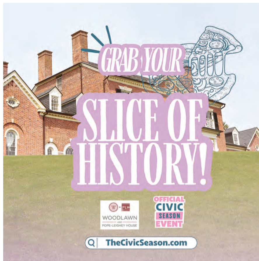
Grab a Slice of History on Friday, June 20, 2025 at Woodlawn & Pope-Leighey House in Alexandria.

❖ On June 19, enjoy traditional African American storytelling and songs reflecting the journey toward freedom at the Washington Revels Jubilee Voices Juneteenth