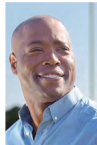
Sen. Aaron Rouse