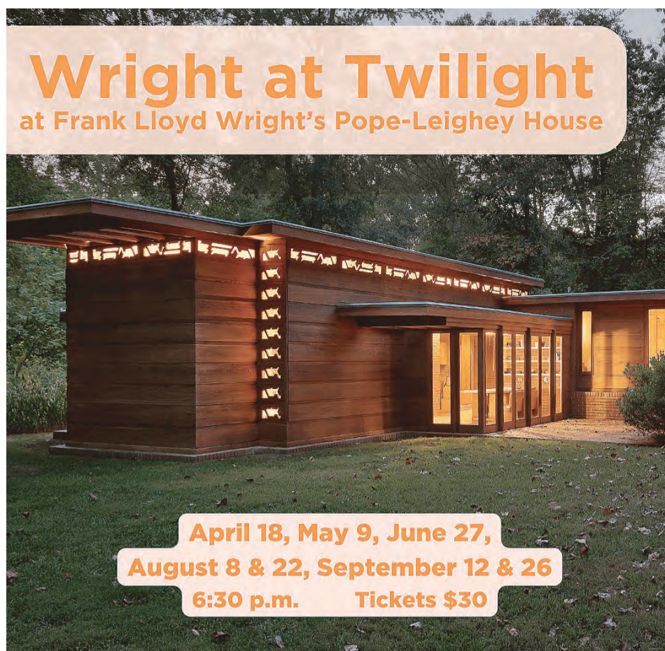
Visit Wright at Twilight on Friday, June 27, 2025 at Woodlawn & Pope-Leighey House in Alexandria.