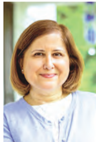
Sen. Ghazala Hashmi