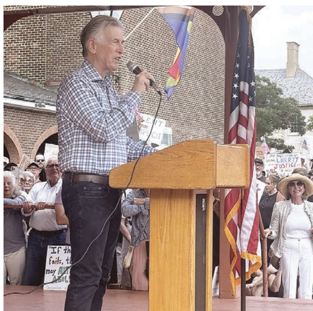
U.S. Rep. Don Beyer (D-8) speaks at the No Kings rally June 14 at Market Square.