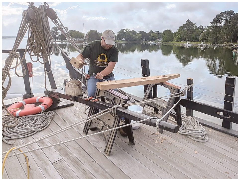
The Tall Ship Providence undergoes restoration and repair in Saint Michaels, Md.