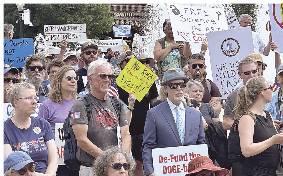
A crowd gathered in Market Square listens to remarks from speakers during the June 14 No Kings rally.