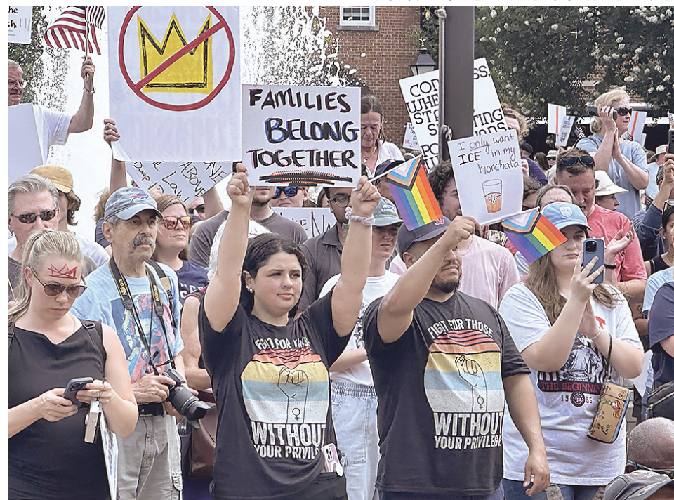
Hundreds turned out holding signs during the No Kings rally June 14 in Market Square.