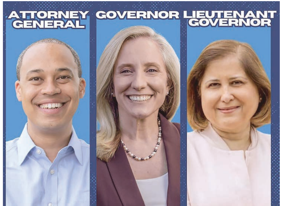
SCREENSHOT VIRGINIA DEMOCRATS @VADEMOCRATS

One history-making change is in the cards, with Spanberger (D) and Winsome Earle-Sears (R) on the ballot for governor, the results of the November election will produce the first female governor of Virginia.