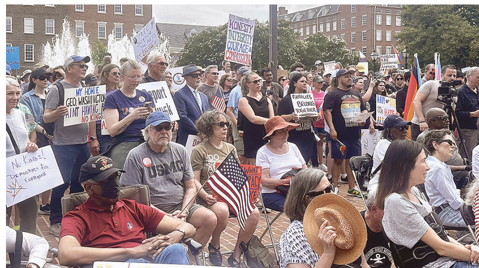
Thousands turned out across the region for the No Kings rallies June 14, including in Market Square.