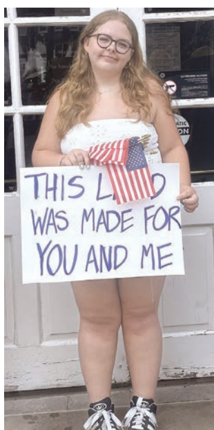
A rally attendee June 14 at Market Square.