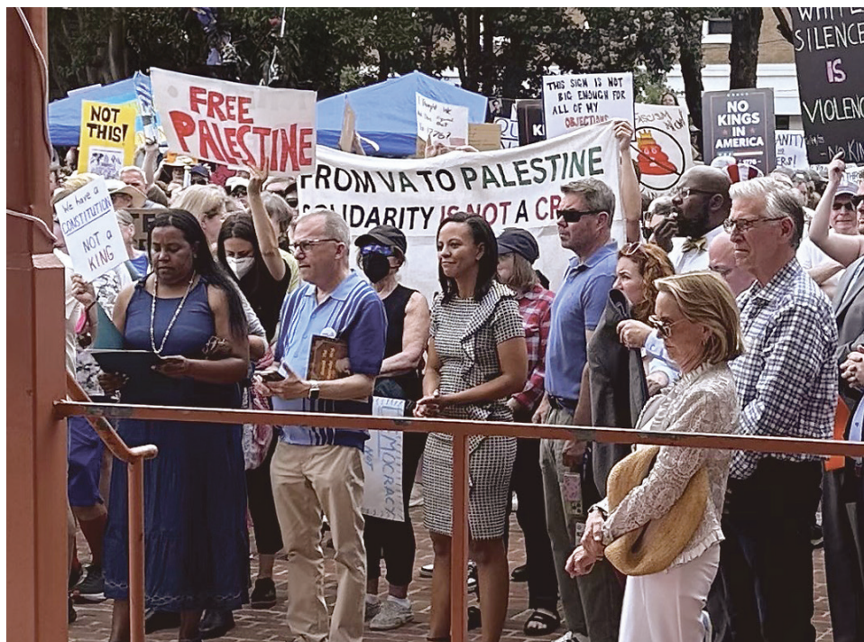
Mayor Alyia Gaskins, center, stands with other elected officials prior to speaking at the No Kings rally June 14 at Market Square.