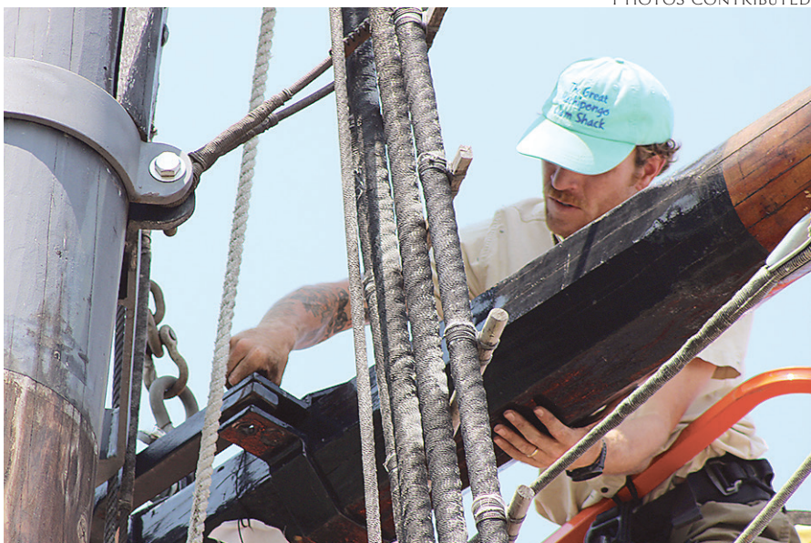
A marine mechanic works on the Tall Ship Providence as it undergoes restoration and repairs at the Chesapeake Bay Maritime Museum in Saint Michaels, Md. Providence is expected to return to her home port in Alexandria sometime in July.