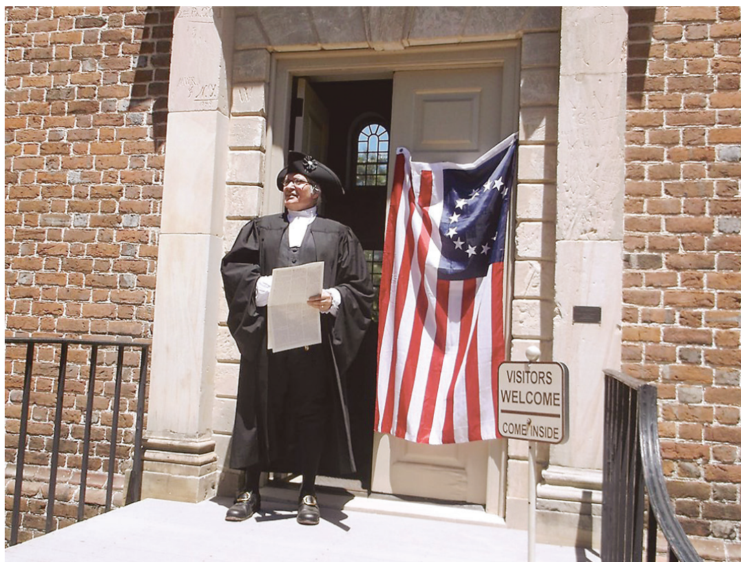
A reading of the Declaration of Independence will take place on Friday, July 4, 2025 at Historic Pohick Church in Lorton.