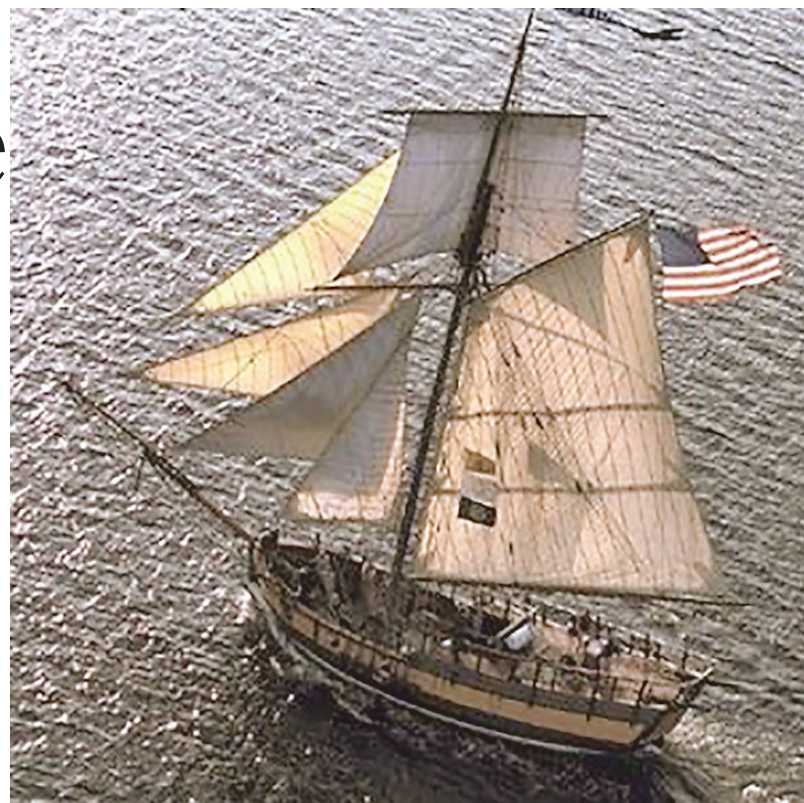
Tall Ship Providence, shown at full sail, is expected to return to the Alexandria waterfront in July.