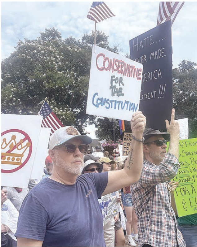
A man holds a sign during the No Kings rally June 14 at Market Square.