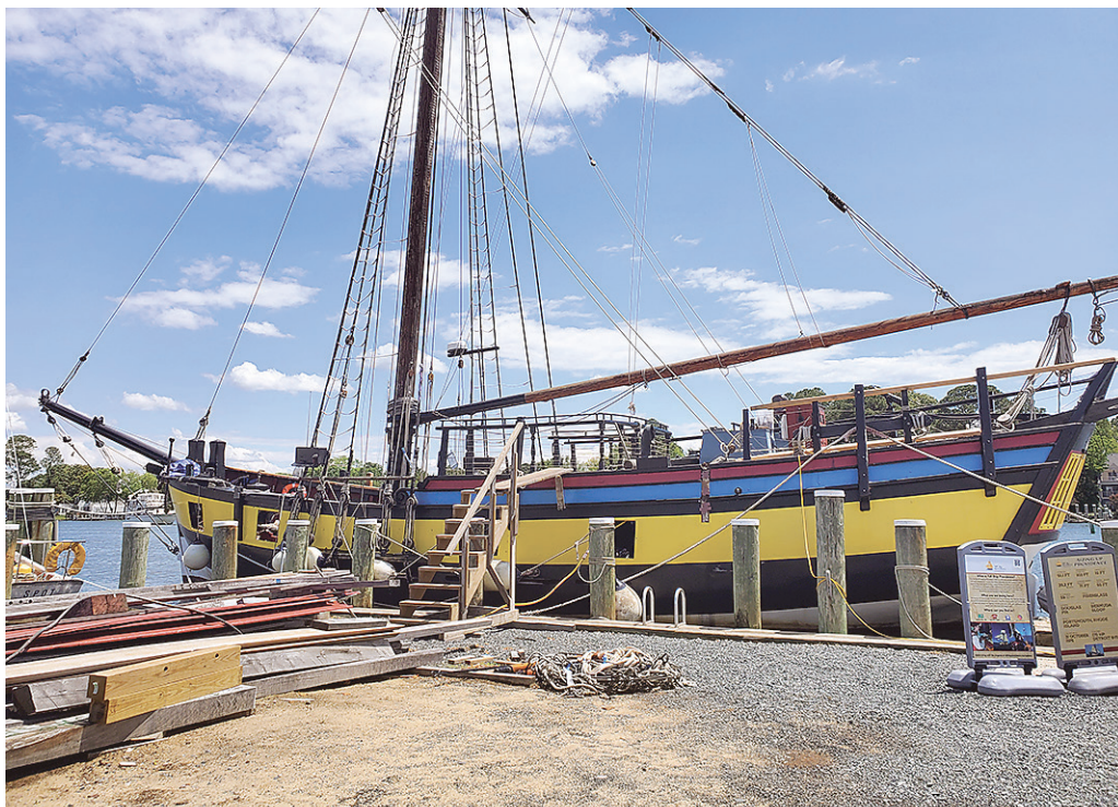
The Tall Ship Providence is completing repairs in Saint Michaels, Md.